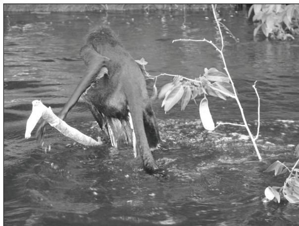
Figure 2. Photography of the adult female black spider monkey ( Ateles chamek ) swimming towards the shore of the state of Mato Grosso, Brazil.