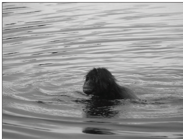
Figure 3. Locomotion of the adult female black spider monkey ( Ateles chamek ) on a submerged branch prior to climbing to tree crowns in the riparian forest of the Guaporé River in the state of Mato Grosso, Brazil.

National Park in the municipality of Santa Cruz, Bolivia (Fig. 1). Next, the specimen began to swim towards the opposite margin, located in the state of Mato Grosso, Brazil. The swimming activity lasted ca. 15 min, and the specimen crossed 38 meters from one margin to the other. The specimen had the body completely submerged, leaving only the head out of the water (Fig. 2), and moved its arms and legs. It was panting and was not scared by our boat; on the contrary, it even climbed onto the boat and walked around the boat's edge before immersing back into the water. Then, the specimen managed to climb onto a submerged branch and began a fast movement between tree crowns in the riparian forest of the Guaporé River, on the Brazilian side (Fig. 3).