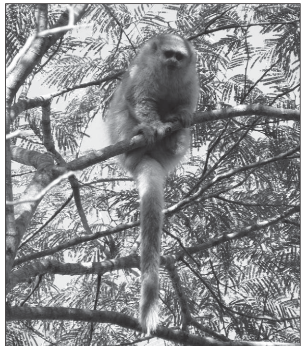
Figure 3. C. pallescens in #8, Rosario Arispe.