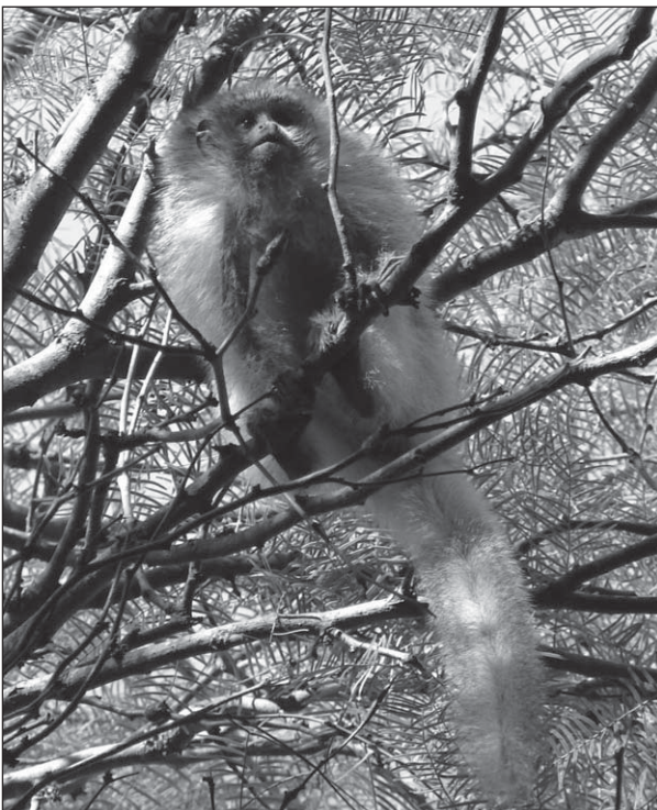
Figure 5. C. pallescens , Río Parapeti #13, Luis Acosta