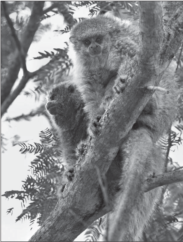
Figure 4. C. pallescens in # 7, Daniel Alarcón.

Pantanal (Smith, 2012). According to all our photos, the color pattern of C. pallescens individuals agreed with the published descriptions of the species, although their faces were not as white as in the drawing from van Roosmalen et al. (2002).