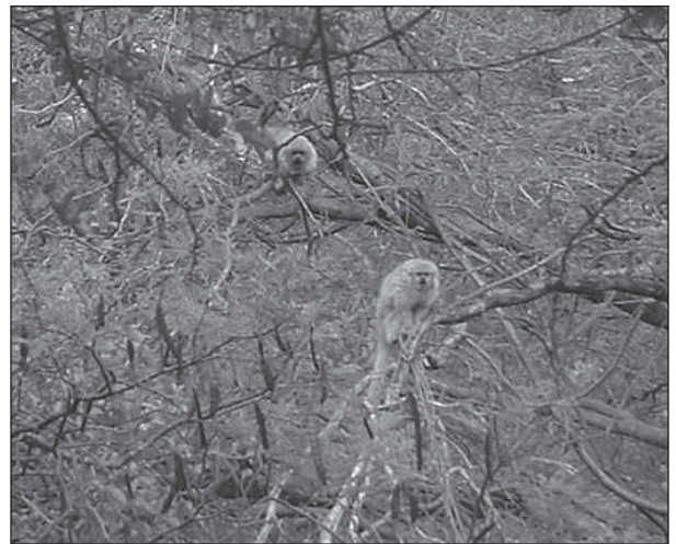
Figure 2. C. pallescens at Ravelo (#1), Martin Thurley.

camp Tucavaca and nearby points (#6, 7, 8), and community sites along the Parapetí river (#13 through 19). From Ravelo and Palmar there are photos and a video that show the long and uniformly colored pale buff pelage of the individuals (Fig. 2), as well as in Sol de Mayo (Fig. 3) and Tucavaca (Fig. 4). The photograph from Paraboca in the Parapetí river (Fig. 5) shows the same light color of the individuals sighted in nearby riparian communities, including the locality # 15 where three specimens were collected in the 1980's and assigned then to C. donacophilus pallescens by Anderson (1997). Sightings and a photo from the Rio Negro in the Otuquis Pantanal (#24, Verónica Zambrana, pers. comm.) also matched C. pallescens descriptions, as well as the photos available from the nearby Paraguayan