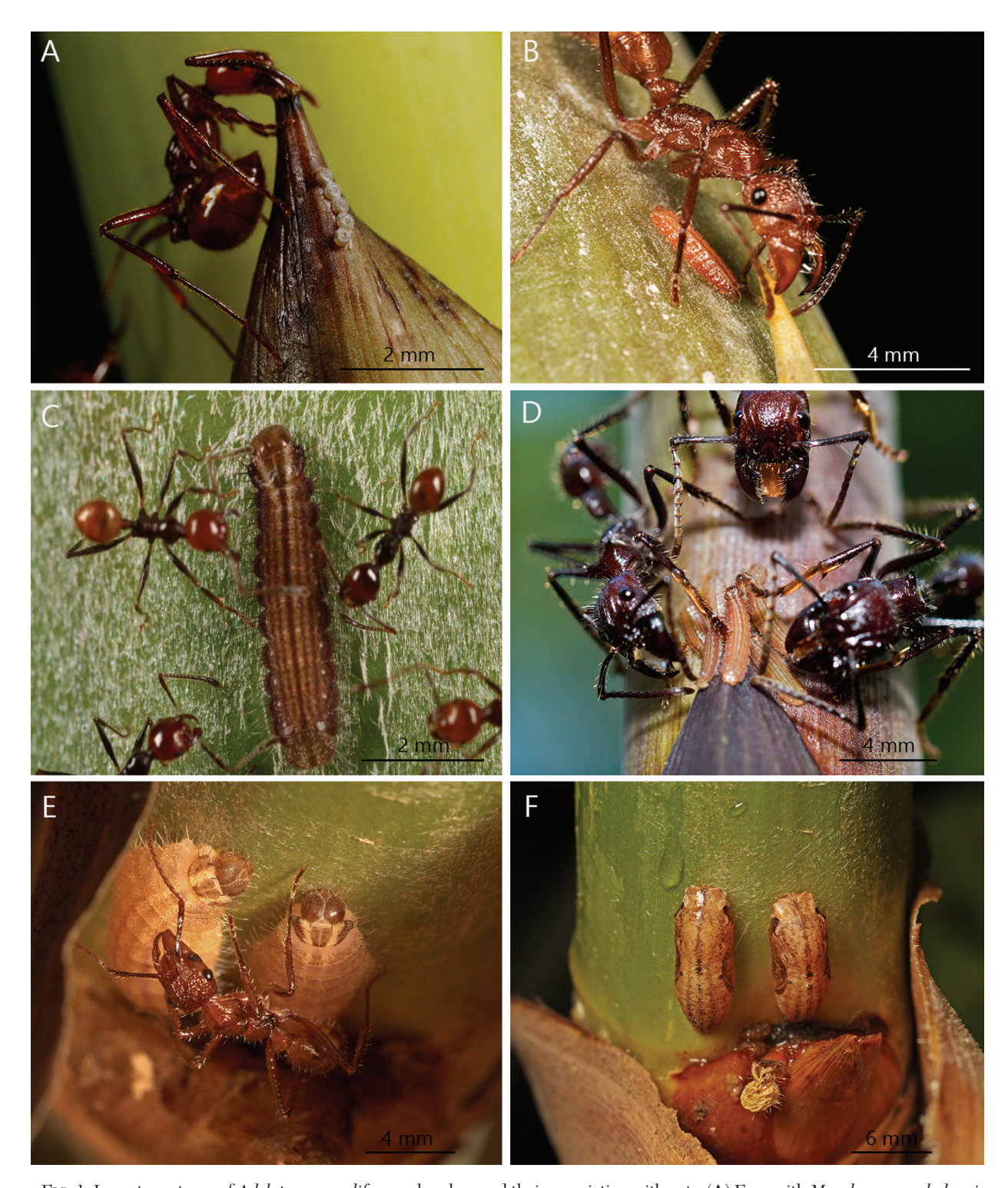
FIG. 1. Immature stages of Adelotypa annulifera on bamboo and their association with ants. (A) Eggs with Megalomyrmex balzani. (B) First instar larva with Ectatomma tuberculatum. (C) Mid-instar larva with Pheidole sp. (D) Mid-instar larvae with Paraponera clavata. (E) Final instar larvae with E. tuberculatum. (F) Pupae.