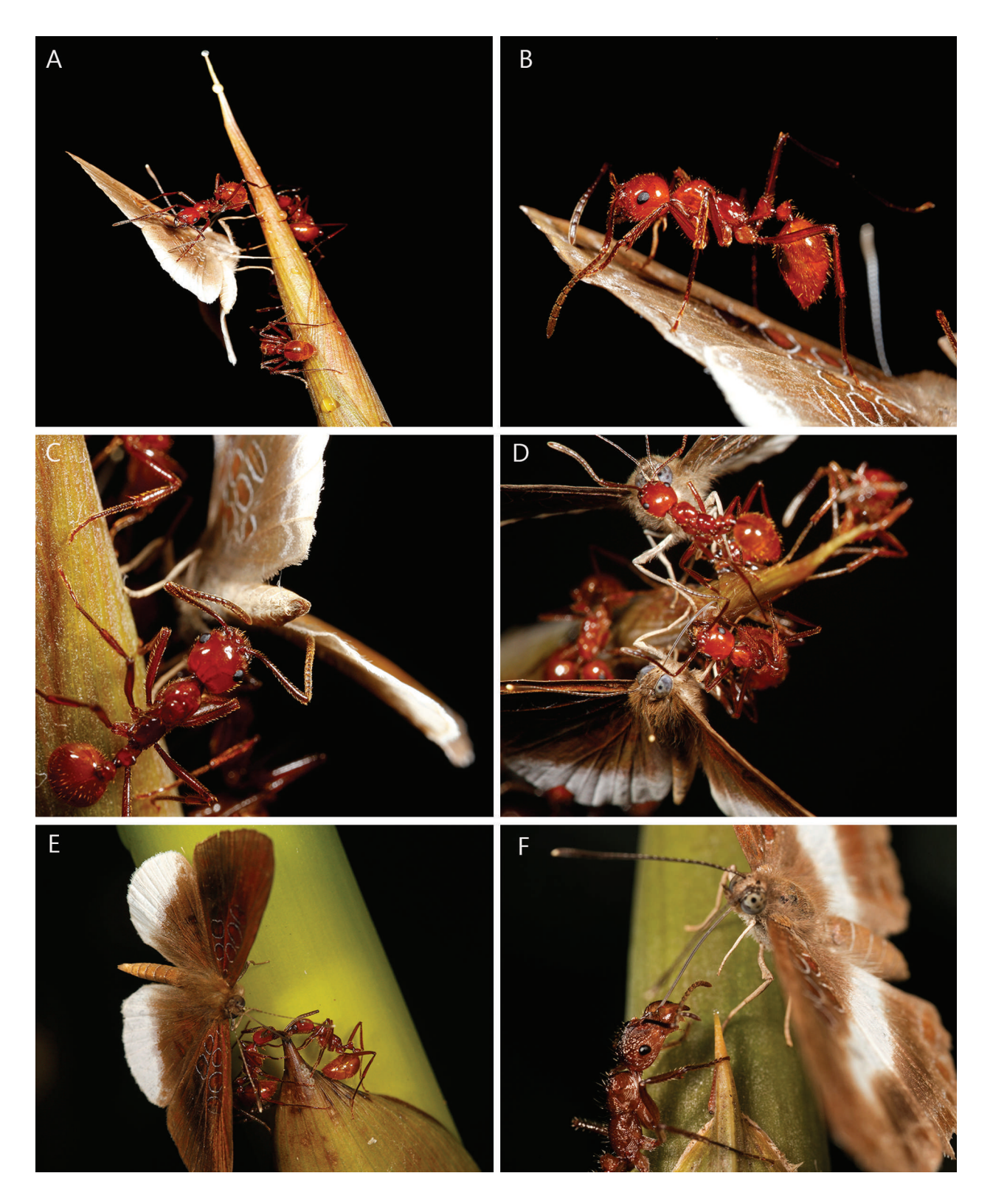
Fig. 4. Adult Adelotypa\ annulifera interactions with ants on bamboo. (A) Antennation of adult butterfly wings. (B) Ant crawling on butterfly wing. (C) Antennation of butterfly abdomen. ( D-E ) Butterflies and ants utilizing extrafloral nectary source on bamboo. (F) Butterfly drinking bamboo fluid directly from Ectatomma ant mandibles.