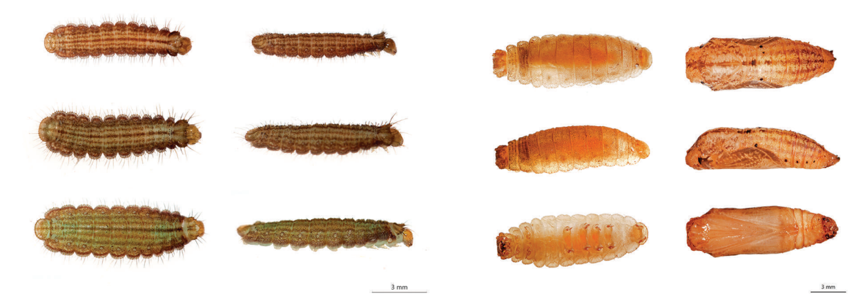
Fig. 2. Dorsal (left) and lateral (right) views of early instar Adelotypa annulifera .