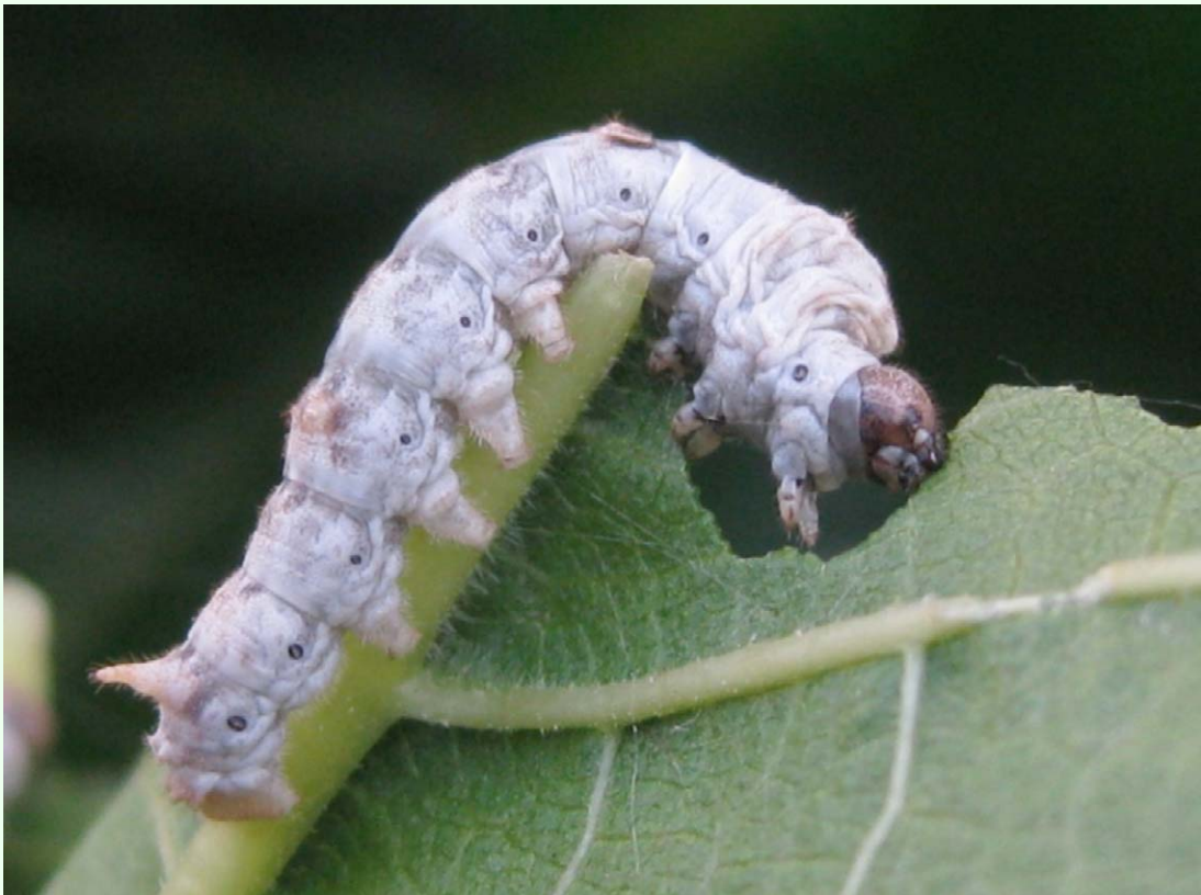
Figure 3. Fifth instar silkworm larva. High quality figures are available online.