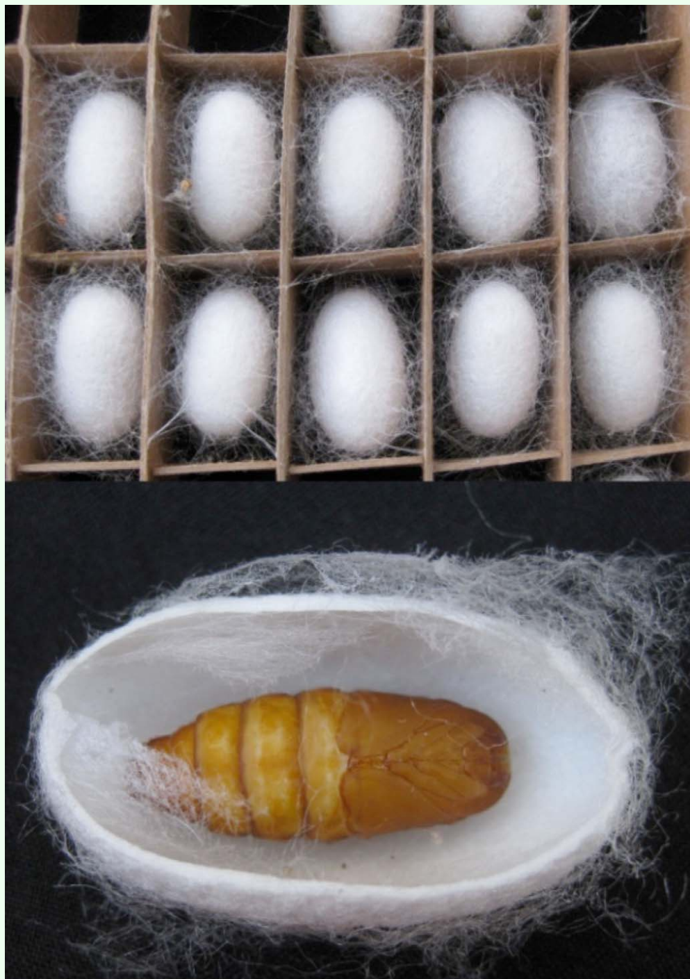
Figure 4. Silkmoth cocoon and pupa. High quality figures are available online.