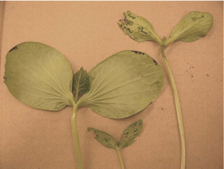
Figure 4. Photograph of squash ('Turks Turbin') (top left), cucumber ('Marketmore 76') (bottom center), and pumpkin ('Magic Lantern') (top right) plants from the laboratory no-choice feeding study. Note the decrease in cotyledon size and increase in intensity of Cerotoma trifurcata feeding damage from squash to pumpkin to cucumber. Damage to each plant was caused by ten C. trifurcata adults over 72 h.

squash plants, with pumpkin plants having an intermediate amount of damage (Table 1; Fig 4; 5). The percentage of plants with stem damage was significantly greater for cucumber and pumpkin plants compared to squash plants ( F = 5.00 , df = 2, 15 , P = 0.022 ), while the percentage of plants with damage to the first true leaf did not differ significantly ( F = 0.83 , df = 2, 15 , P = 0.45 ) (Table 1). Significantly more cotyledon area had distinct holes on cucumber plants than pumpkin or squash plants ( F = 11.88 , df = 2, 15 , P = 0.0008 ) (Table 1). The percentage of the lower ( F = 16.86 , df = 2, 15 , P = 0.0001 ) and upper ( F = 9.21 , df = 2, 15 , P = 0.0025 ) surface of the cotyledons scarred for cucumber and pumpkin plants was significantly greater than that of squash plants (Table 1).