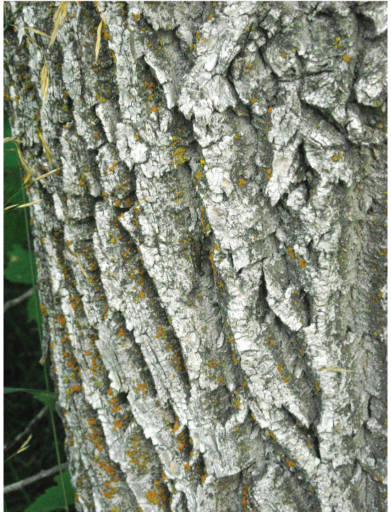
Fig. 6. Female Melanoplus punctulatus photographed at Chadron State Park on bark of green ash. Individuals are extremely cryptic when on this substrate. Female is located at exact center of figure.