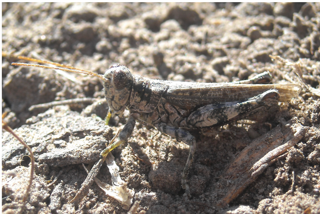
Fig. 5. Male Melanoplus punctulatus photographed on soil of campground trail at Chadron State Park.

ash throughout the Great Plains, or if it associates with other plant species. The specimen from Richardson County in 2008 was collected from the trunk of an oak ( Quercus sp.) tree (Brust et al. 2008), and we found them on hackberry and wild grape (see above).