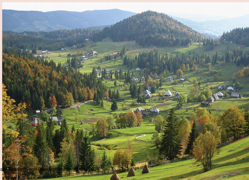
FIGURE 1 Landscape near Ocoale and Ghețari (1100–1300 m) in the Apuseni Mountains, characterized by dispersed settlements, grassland, and forest.

other activities including crafts, trade, and forestry, are their basic means of survival. Inhabitants have adapted their practices to the natural environment and have formed landscapes rich in structures, vegetation types, and species. The forests provide timber for construction and boards, firewood, wood pasture, berries, and mushrooms. The open land is dominated by meadows and pastures. Hay meadows are found on deeper soils. These are fertilized with manure and harvested manually using a scythe. Unfertilized grassland occupies the steeper and less fertile soils, mainly providing pasture.