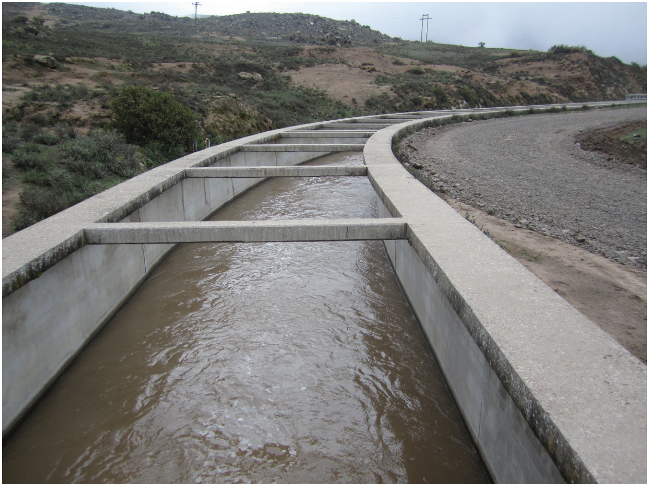
FIGURE 5 The Majes Canal.

significantly since Cabanaconde began to receive water from the Majes Canal.