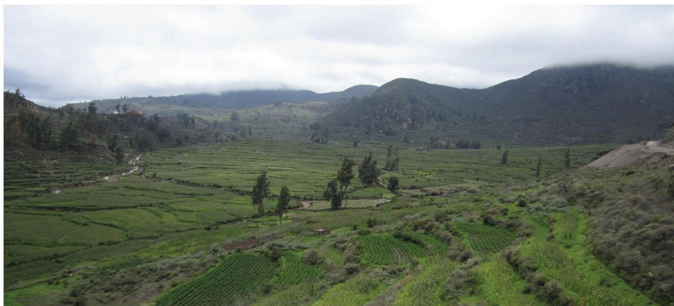
FIGURE 4 The campiña of Cabanaconde, the village's largest agricultural area.

resistance from Cabaneños (Gelles 2000: 69–74). A small group of villagers supported the state's attempt to modernize water management, but the majority opposed it, pointing to the advantage of using a dual model that