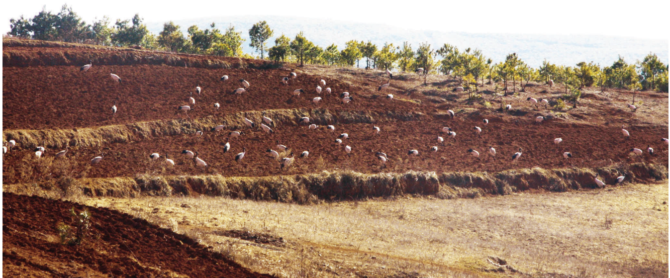
FIGURE 2 Wintering BCNs in Huize Nature Reserve benefit from abundant food stored in traditional cultivated fields; in this area, 145 cranes were seen foraging for potatoes and turnips in the harvested potato fields in 2009.

Daqiao reservoir dam in 2005 elevated the surface of the water and submerged cultivated fields and swamps.