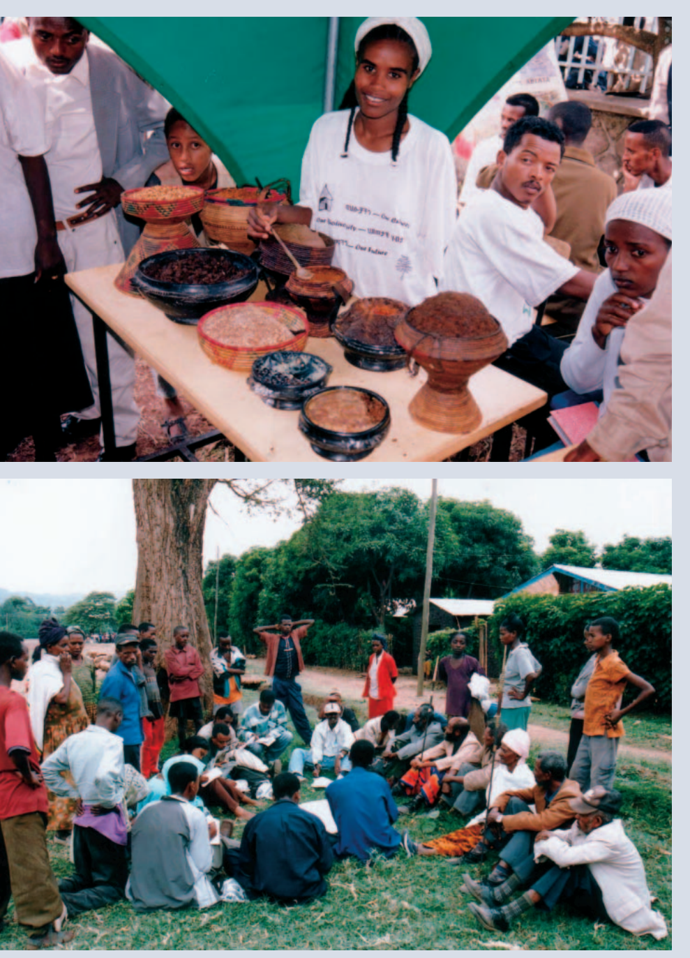
FIGURE 3 Discussion between students and community members in a participatory exercise, Arba Minch, July 2004. (Photo by Solomon Hailemariam)

FIGURE 2 A student from Dej. Geresu Dukii High School explaining her traditional foods, Wolisso, July 2002. (Photo by Solomon Hailemariam)