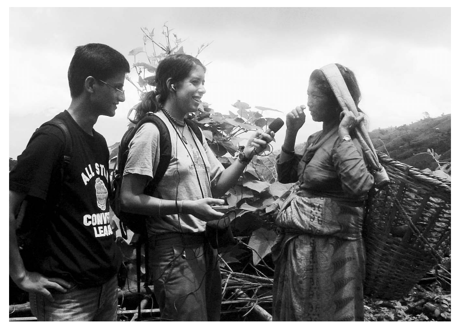
FIGURE 1 Interviewing a Tamang woman. Bhojeni, Kathmandu District, Nepal.

In the first phase, 8 such programs will be produced. As this is a pilot phase, the purpose is to assess whether such an approach—which