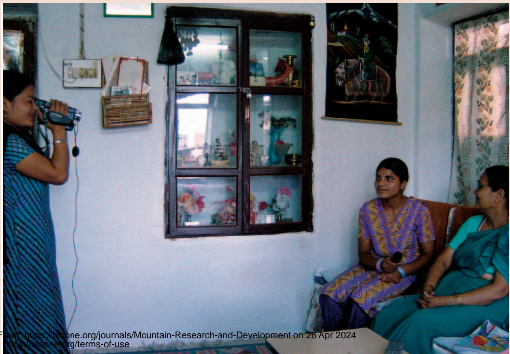
FIGURE 4 Two young producers film and conduct an interview as part of Jeevanko Goreto (Path of Life). The CMC's focus is on youth, and young women constituted a majority of the 174 participants that the CMC trained in the first year of the program.

Direct access to the Internet is also opening up new ideas and spaces for exploration. After a computer training program for 30 housewives, a handful of women have started using email to keep in touch with family members abroad. They also search the Internet for new recipes and hair styles to put to use in small businesses. To address the lack of good materials available in masters-level programs, the CMC is introducing a specialized course for local campus lecturers on searching and using the Internet.