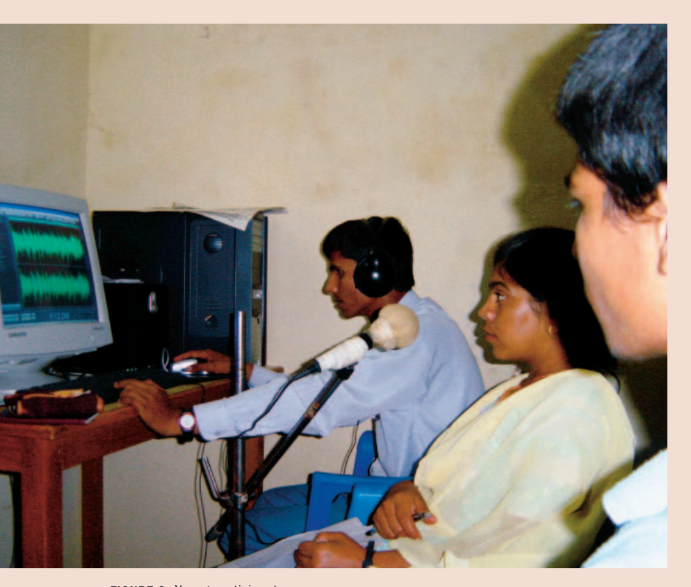
FIGURE 3 Young participants learn to edit audio in the CMC's makeshift studio. Remarkably, Tansen boasts no less than 3 FM radio stations in the town itself.