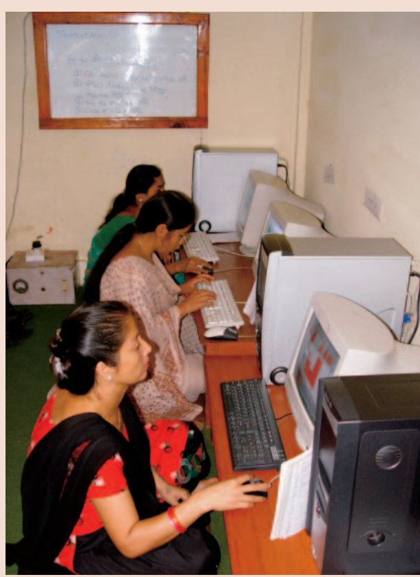
FIGURE 5 Housewives taking a computer course at the CMC in Tansen. Drawing on tradition and saving on furniture costs, the CMC set up computers on low tables so that users could sit on cushions on the floor. The arrangement helps to give the center a less formal air—part of the process of de-mystifying the technology and making users feel at home.

With 3 new FM radios broadcasting from Tansen, at least another 4 FM stations in the area, as well as 5 TV stations in the capital, the Tansen CMC organizers feel they are in a unique position to provide both skilled human resources as well as high quality audio and video program productions.