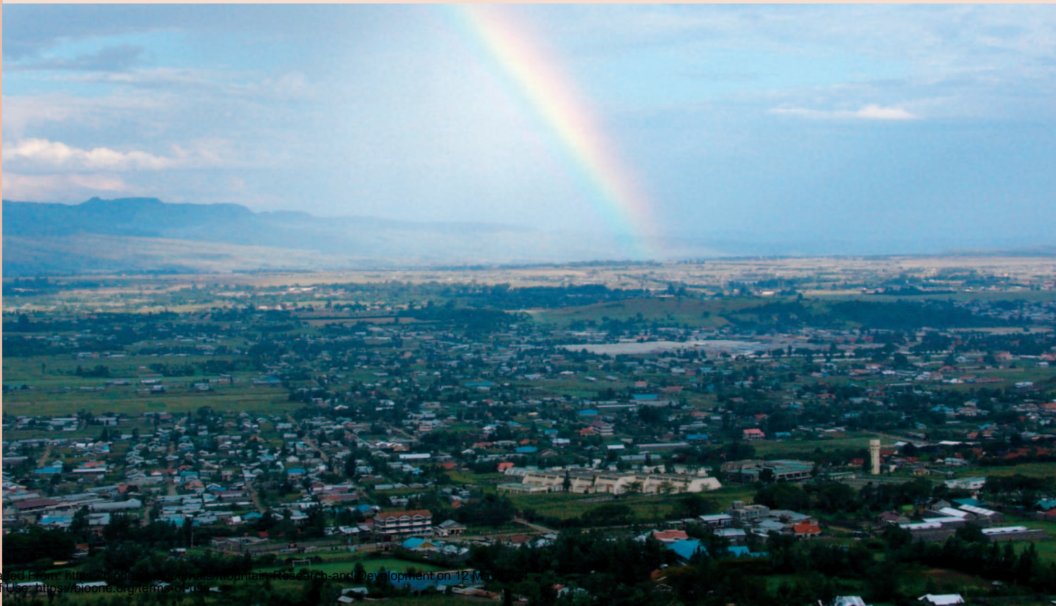
FIGURE 1 Nakuru town in the Bahati Highlands. Located partly outside the municipal boundaries, this part of town is undergoing rapid urbanization at the expense of valuable agricultural land.

On the northern side of town, the Menengai Crater (2490 m)—one of many extinct volcanoes in the Rift Valley, on the