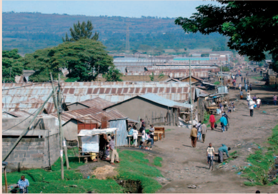
FIGURE 4 The inability of public institutions to cope with rapid urban growth has led to the formation of vast and poorly serviced informal settlements at the southern edge of town. The LUO project now enables stakeholders to monitor urban development according to different criteria, including socioeconomic ones.

level, in a participatory manner (Figure 5), and complemented with statistics from various sources. Community representatives use high-resolution satellite images to map information layers, which are later prepared by the LUO project team for analysis in a GIS environment. Data collected in this manner have a high accept-