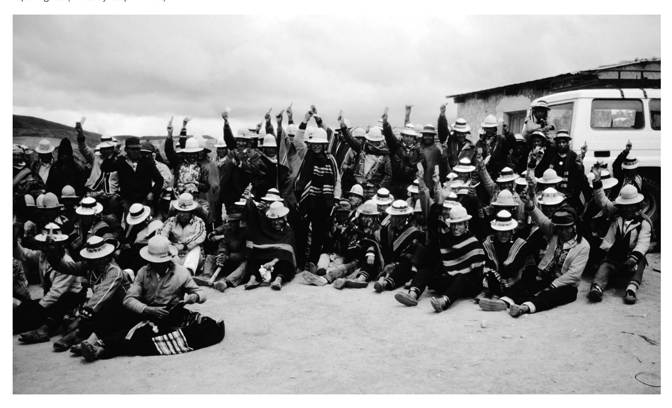
FIGURE 4 During the annual ayllu assembly, authorities representing the traditional ayllu organization and the modern sindicatos participate with equal rights.

Nature, which in turn allowed a reinterpretation of the ecological situation in relation to social and religious-spiritual life. The connecting element between Nature and society is a morally correct action, but in this particular case, acting "correctly" not only means fulfilling a set of defined moral values; it also implies that the community must understand the world according to Andean concepts of life, Nature, and society. This represents a shift from single- to doubleloop processes of social learning. Thus, solutions to current problems are essentially perceived as a social and cognitive issue that requires combining deep reflection with an ongoing effort to decode, differentiate, and internalize ethical principles in everyday actions, resulting in an increase of social competencies that permits internally driven transformations of social organization.