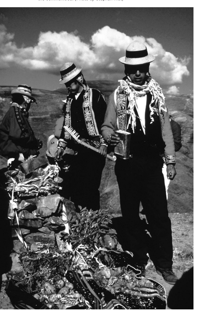
268 FIGURE 3 The revitalization of rituals dedicated to Pachamama (Earth's mother) was an important element in reintegrating separate groups within the communities.

for example, through increased use of organic fertilizers or shortening of the fallow period on the ayanokas , was perceived as a potential alternative. Meanwhile, other sindicatos advocated privatization of land as a precondition for intensification of land use.