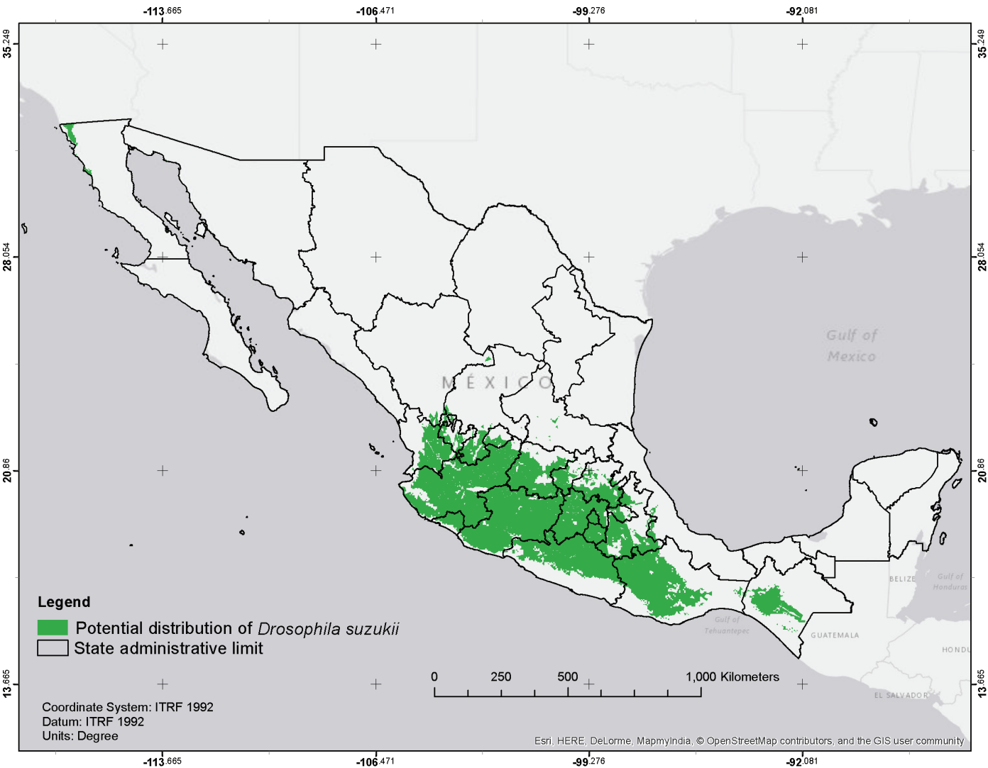
Fig. 1. Potential distribution Drosophila suzukii in México based on MaxEnt modeling.

a Environmental variables coded as Bio1 to Bio19 as indicated in http://www.worldclim.org/bioclim