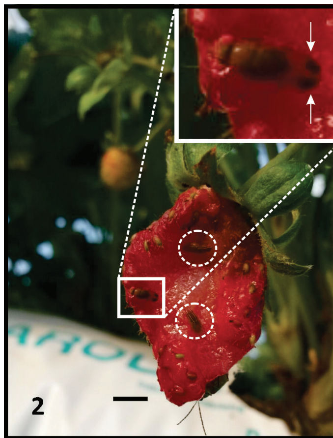
Fig. 2. Damaged strawberry in the field with drosophilid flies including a Drosophila sukukii male (inlet) with its characteristic wing black dots (arrows) and 2 adults of Zaprionus indianus (white circles), scale bar = 5 mm.

We thank the CAPES Foundation, the National Council of Scientific and Technological Development (CNPq), the Minas Gerais State Foundation for Research Aid (FAPEMIG), and the Arthur Bernardes Foundation (FUNARBE) for grants provided to this work.