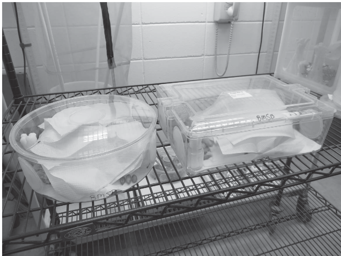
Fig. 1. Clear plastic rectangular and circular containers for rearing Halyomorpha halys .

significantly improved the BMSB rearing success. Other foods occasionally added to the diet included raisins [ Vitis vinifera L. (Vitaceae)], apple [ Malus pumilla Mill. (Rosaceae)], papaya [ Carica papaya L. (Caricaceae)], mango [ Mangifera indica L. (Anacardiaceae)], okra, orange [ Citrus sinensis (L.) Osbeck (Rutaceae)], tangerine [ Citrus tangerine (Tanaka) Tseng (Rutaceae)], cucumber [ Cucurbita sativus L. (Cucurbitaceae)], jalapeño [ Capsicum frutescens L. (Solanaceae)], tomato [ Lycopersicon esculentum Mill. (Solanaceae)], strawberry [ Fragaria × ananassa (Rosaceae)], common ragweed [ Ambrosia artemisiifolia L. (Asteraceae)] bouquets and other seasonal produce. Layers of Kimwipes® Kimberly-Clark and paper towels were placed inside the containers to provide an oviposition substrate, hiding places, and additional surface area. Egg masses were hand collected every other d. This method proved to be very effective for obtaining fresh high quality eggs (Fig. 2). To avoid egg predation by adults and to avoid overcrowding, egg masses were collected regularly and placed in a separate labeled container. Nymphs tended to feed on the eggs, and