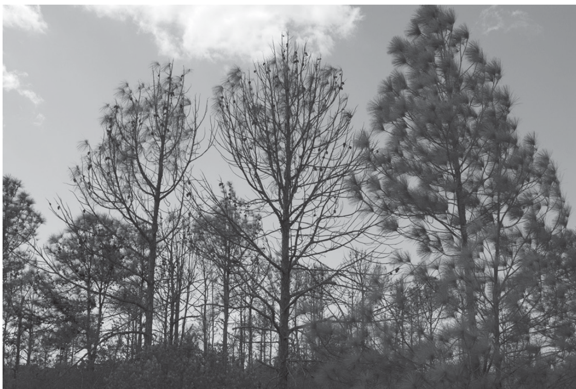
Fig. 1. Caribbean pine trees on North Caicos, Turks and Caicos Islands—range of damage caused by pine tortoise scale.