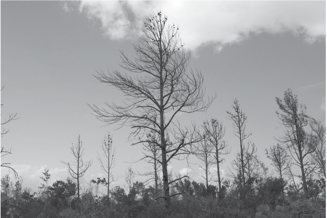
Fig. 2. Caribbean pine trees on North Caicos, Turks and Caicos Islands—trees killed by pine tortoise scale.

(Kairo et al. 2000). Yet despite the potential environmental and agricultural importance of invasive scale insects they have hardly been studied in many Caribbean countries.