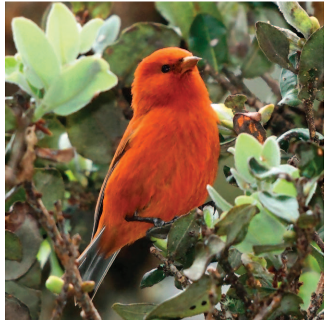
FIGURE 1. Male Hawai'i 'Ākepa ( Loxops coccineus coccineus ). These endangered Hawaiian honeycreepers are 1 of only 18 extant species from more than 50 Drepanidinae that evolved in the Hawaiian Islands. This specialist insectivore is found only in montane old-growth forest on the island of Hawai'i and uses its crossed bill to open leaf buds and expose the insects, primarily microleps and spiders, on which it feeds.

We used the standard statistical procedure of log-transforming population densities to control error variance (Neter et al. 1996). Although residual plots are useful for assessing whether the variance of the error terms is constant, their interpretation is somewhat subjective, and concluding definitively between residuals expressing a pattern or providing an adequate fit can be difficult. This is especially true of our time series with fewer than 30 points. Therefore, we used the modified Levene test to provide a