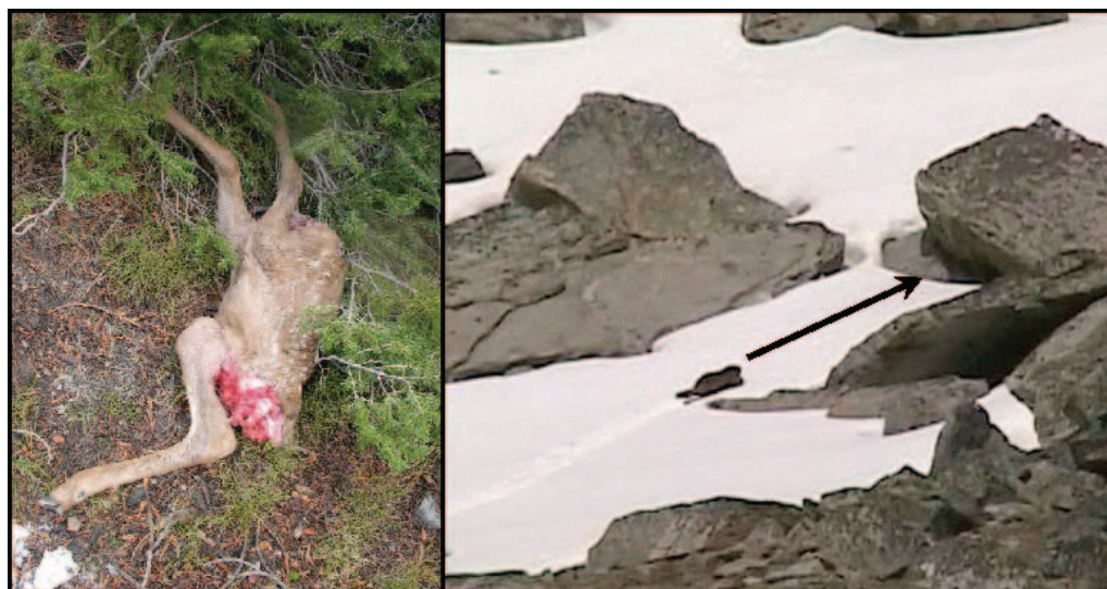
FIG. 3. —This elk calf was killed by a female wolverine ( Gulo gulo ) on 16 June 2004 in southwestern Montana. She had moved parts of the carcass to a rendezvous site where she had a cub. She dragged the remainder of the carcass to another cache site under large boulders (right photo) where there was ice that was likely to be present until autumn. Structure and cold temperatures may be critical habitat features for cache longevity because they inhibit competition from avian, mammalian (e.g., bears), insect, and bacterial competitors.

of the timing of reproductive events, summer foods appear to have an equally important role, and the limited information specific to summer diet indicates that predation on small prey occurs frequently in most areas (Gardner 1985; Lofroth et al. 2007; Magoun 1987; Packila et al. 2007). Total biomass obtained from small prey can be significant; 1 female was observed to eat 2 small mammals or ptarmigan chicks, an adult ptarmigan, a ground squirrel, and 2 eggs during a 2 ½-h period in June (Magoun 1987). In addition, wolverines have been documented as the main predator of woodland caribou calves during the calving season (Gustine et al. 2006), and predation on reindeer and other ungulate neonates occurs (Björvall et al.