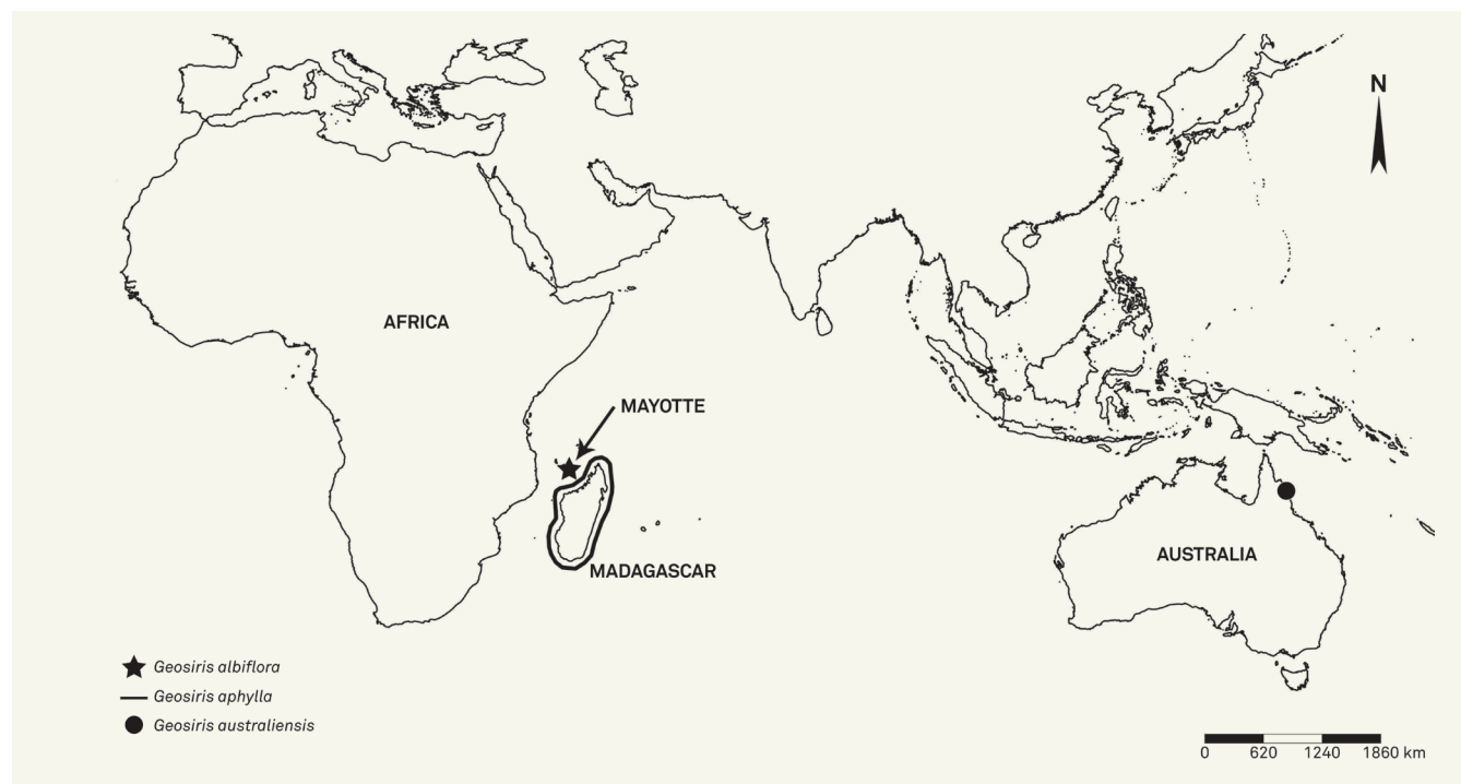
Fig. 4. – Distribution of the three Geosiris Baill. species.