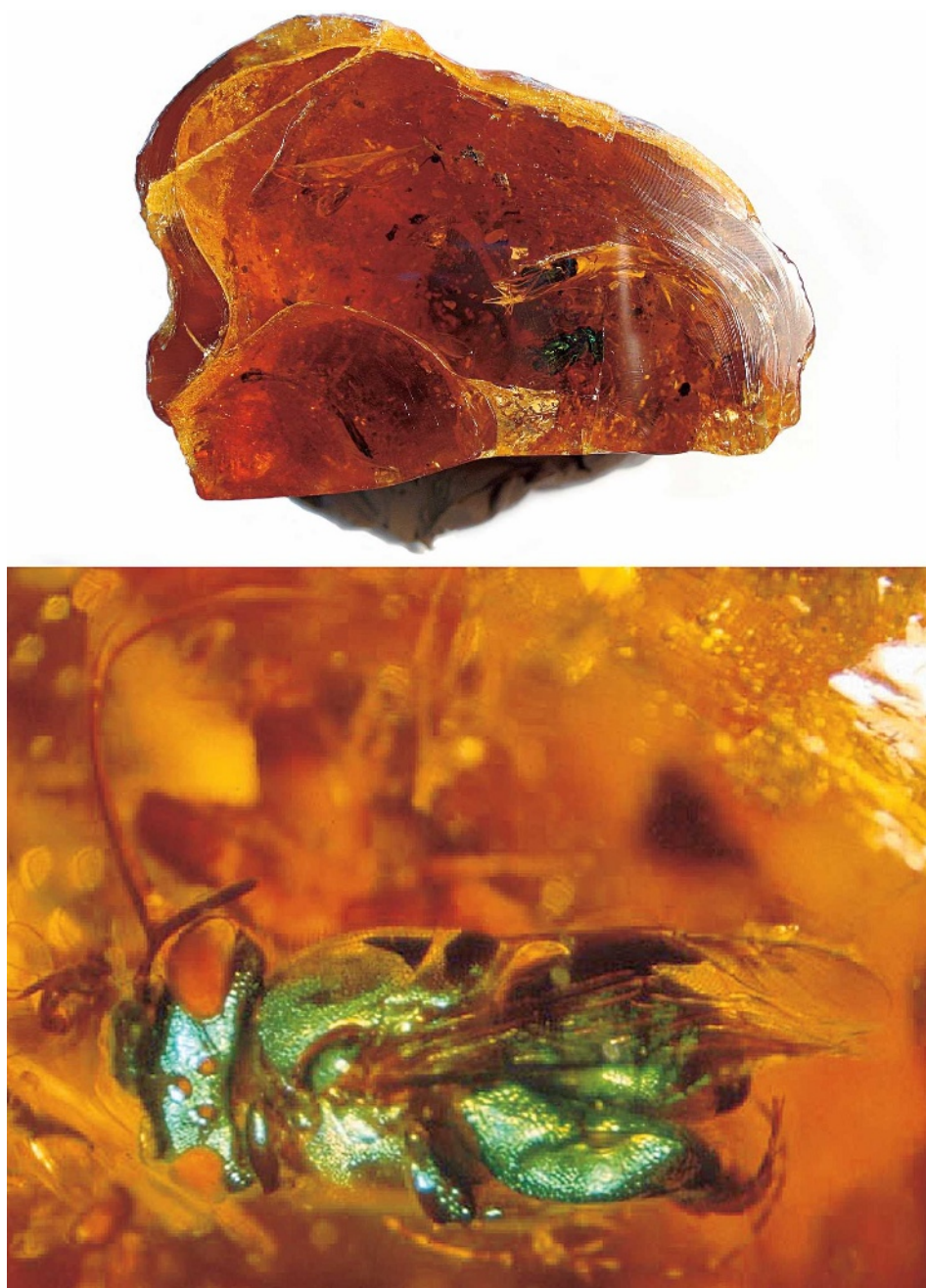
Fig. 1. Photomicrograph of Euglossa ( Euglossa ) cotylisca Hinojosa-Díaz and Engel, new species (NHML Pal. PI II 670 [1]) in Colombian copal; above , a view of the entire piece encapsulating the bee; below , dorsal aspect of the bee in detail. [Upper image by I.A.H.-D., 2006; lower image by P.V. York, reproduced with permission of the NHML, © The Natural History Museum, London].