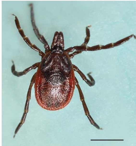
FIGURE 2. Ixodes pacificus , unfed female (bar, 1 mm), after molting from a nymph that was collected from a California Quail. Using PCR and DNA sequencing, this tick tested positive for B. burgdorferi s.s.