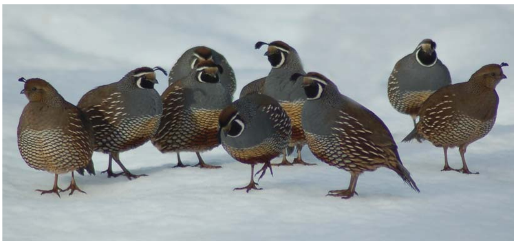
FIGURE 3. A covey of California Quail on Vancouver Island, B.C. after a rare snowstorm.

When California Quail forage, it is not unusual to encounter 20 quail, or more, in a single covey (Fig. 3). These ground-dwelling birds inhabit thick undergrowth and low-lying vegetation in southern British Columbia where they become parasitized by host-seeking ticks. In fact, they become maintenance hosts for ticks, and potentially these game birds may act as reservoir hosts for B. burgdorferi s.l.