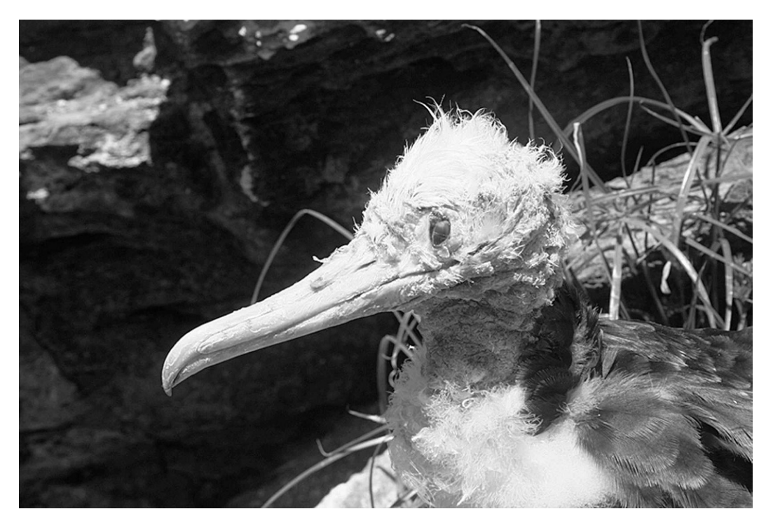
FIGURE 1. Skin lesions and cornea alteration in a Frigatebird chick.

maxima, Sterna eurygnatha, Sterna fuscata, Anous stolidus, and Larus atricilla). In the following 2 wk, 33 more dead chicks were recorded, and 27 chicks had clinical signs. After 1 mo, 41 additional dead chicks were recorded. Through intense monitoring of nests, it was confirmed that symptoms were always lethal: no animal with clinical signs recovered.