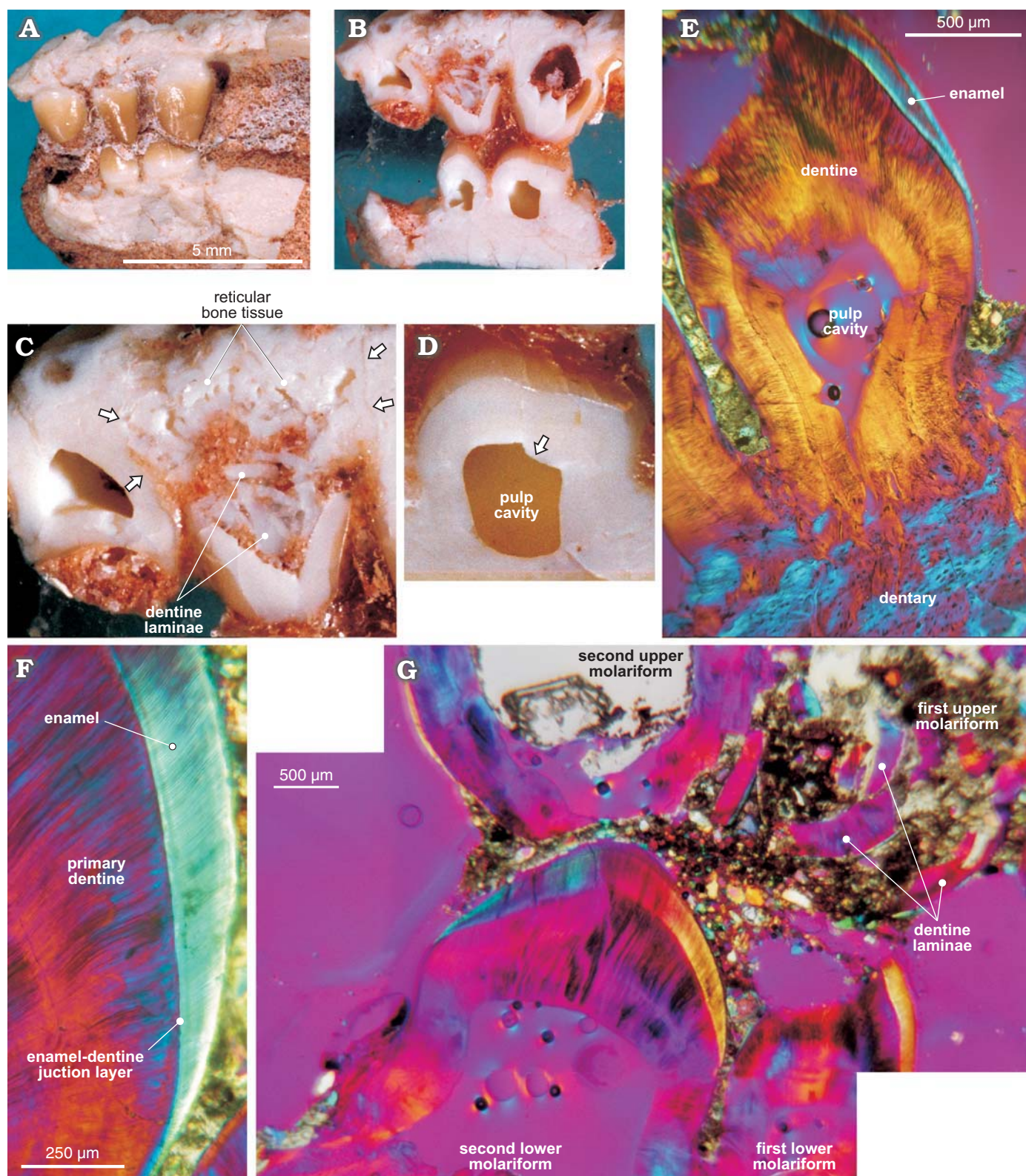
Fig. 1. The procolophonid Soturnia caliodon Cisneros and Schultz, 2003, UFRGS PV1112T, from the Norian (Upper Triassic) Caturrita Formation of Rio Grande do Sul, Brazil. Partial left maxilla and mandible, before preparation (A), and during initial stages of preparation (B). C. I2 (to the left) and M1 (to the right), showing the limits of tooth morphogenetic fields (indicated by arrows), reticular bone tissue, fragmentary dentine, indicating tooth resorption in M1. D. A pronounced secondary dentine pulp deposition (indicated by an arrow) in m2. E. m1, note that enamel is completely absent in the cervix. F. Portion of m2 crown, showing the transition of thick enamel in the apex (to the top) to a very thin enamel close to the cervix (to the bottom). G. M1, M2, m1 and m2. Note remnant dentine fragments in most of M1. A–D in labial view, anterior is to the left. E–G in lingual view and under polarized light.