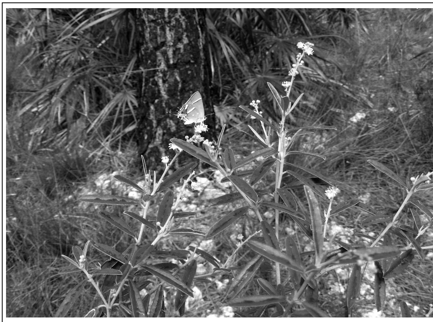
Figure 1. Croton linearis in Miami-Dade County's Larry and Penny Thompson Park. This male plant is being visited by the federally endangered butterfly, Bartram's scrub-hairstreak.

ami, and Navy Wells is 48 km southwest of downtown Miami. Both areas have well-established populations of Bartram's scrub-hairstreak (USFWS 2014). The Florida leafwing was once established in both regions, but has not been documented as maintaining a population at either location in the past 25 years (USFWS 2014). For each of the two core areas, we selected preserves to survey if they contained pine rockland and were within four km of the core. We further narrowed our criteria to include only preserves owned and managed by Miami-Dade County, thus excluding approximately 250 ha of pine rockland in the Richmond area that are in federal or private ownership. With these restrictions in mind, we selected ten preserves total-