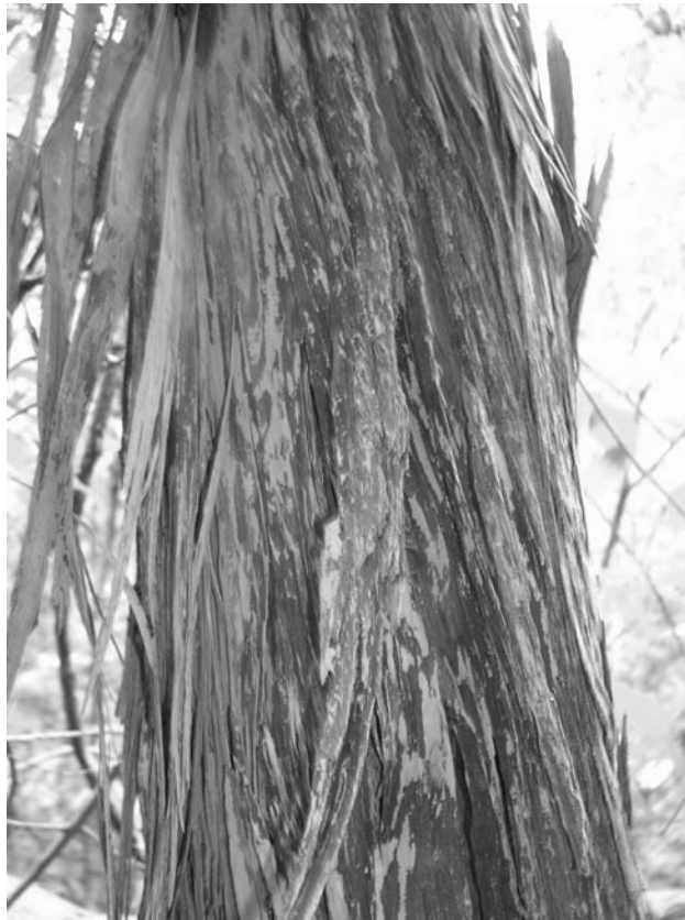
Fig. 2. Trunk of Tetrazygia decorticans , with bark peeling off in laminar shreds.

species is very rare. It occurs from 600-650 m in seasonally wet evergreen forest. Associated melastome species include: Miconia prasina (Sw.) DC., Meriania leucantha subsp. nana (Triana) Borhidi, Tetrazygia bicolor (Mill.) Cogn. and Clidemia barbeyana Cogn. Other associated species include Calyptronoma plumeriana (Mart.) Lourteig, Cyathea arborea (L.) Sm., Alsophila cubensis (Underw. ex Maxon) Caluff & Shelton, Cinnamomum montanum (Sw.) J. Presl, Ocotea leucoxylon (Sw.) Mez, Guarea guidonea (L.) Sleumer, Talipariti elatum (Sw.) Frixell, Roystonea regia (Kunth) O. F. Cook, Dendropanax arboreus (L.) Decne. & Planch., Faramea occidentalis (L.) A. Rich., Wallenia laurifolia (Jacq.) Sw., Citharexylon caudatum L., Casearia sylvestris Sw. subsp. sylvestris and Tabernaemontana ambliocarpa Urb.