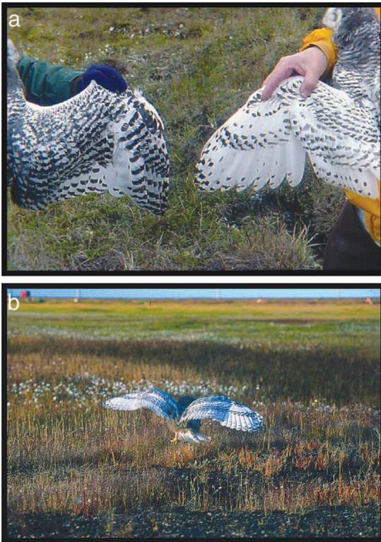
Figure 5. (a) Distinct plumage patterns suggest sex differences between male and female at 36–43 d. Notice less barring and more spotting on male secondaries and more barring and less spotting on female secondaries. (b) Young fledge around 44–55 d.

(see Bruce 1999, Holt et al. 1999, König and Weick 2008), and mesoptile down varies in color among species. Most species of owls are nocturnal or active at low-light levels, and only females incubate and brood. Thus, we hypothesize that there is no need for eggs or nestlings to evolve cryptic coloration because they are almost constantly covered by the female. Thus, white may be a neutral or default color favored by natural selection, and energetically cheaper to produce.