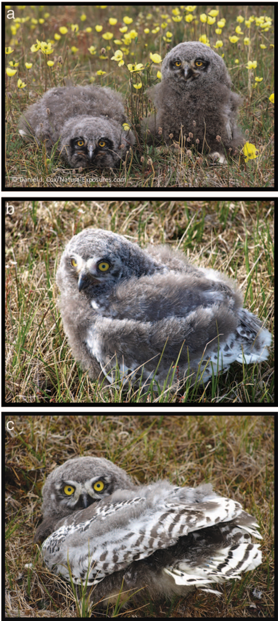
Figure 4. (a) Very mobile, can run, departs nest about 3 wk old, tail feathers conspicuous. (b) Eyes deeper yellow; juvenile plumage emerges, showing white X on face 22–28 d; tail quills erupt about 25 d. (c) White mask forms on face, juvenile upper wing coverts and flights feathers distinct at 29–35 d.

mesoptile (second) natal down at about 1 wk of age, and within 2 wk of age they were mostly covered in the mesoptile down. These findings were similar to other studies (Sutton and Parmelee 1956, Watson 1957, Tulloch 1968, Potapov and Sale 2012).