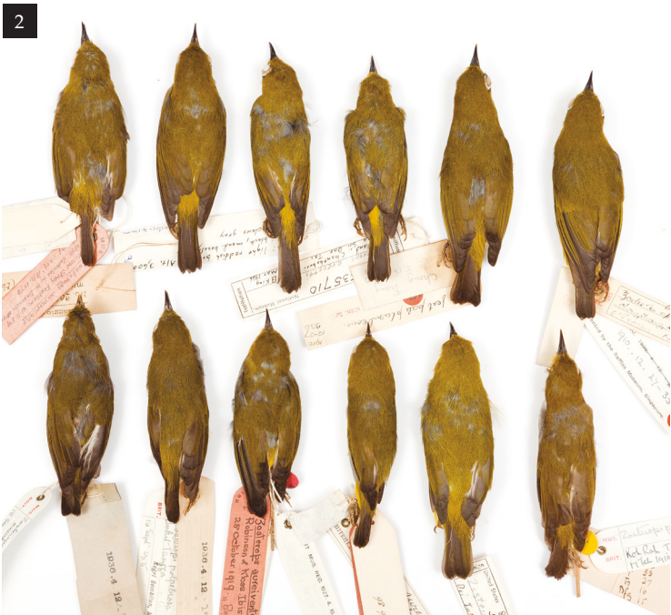
Figures 1–2. The Zosterops auriventer grouping and neighbours, in ventral and dorsal views. Top row in each, left to right: auriventer (Tavoy, Tenasserim; holotype); auriventer (Mulayit, Dawna Range, Tenasserim); two wetmorei (Soi Dao Tai peak, south-east Thailand); two wetmorei (Trang, Peninsular Thailand); bottom row: two tahanensis (Main Range, Peninsular Malaysia); medius (Sadong peak, south-west Sarawak, Borneo; holotype); medius (Mount Kinabalu, Sabah, Borneo; holotype of parvus ); Z. palpebrosus siamensis (Doi Inthanon peak, north-west Thailand); Z. palpebrosus williamsoni (Ra Island, Peninsular Thailand)

Borneo including the types of its synonyms medius (south-west Sarawak) and parvus (Mount Kinabalu, Sabah) are inseparable. All have white lower wing-coverts, one common tone and distribution of lead grey on breast and flanks, a common extent of ventral yellow, and similar dorso-ventral merging of colours behind the jaw. Dorsally (Fig. 2), all show the