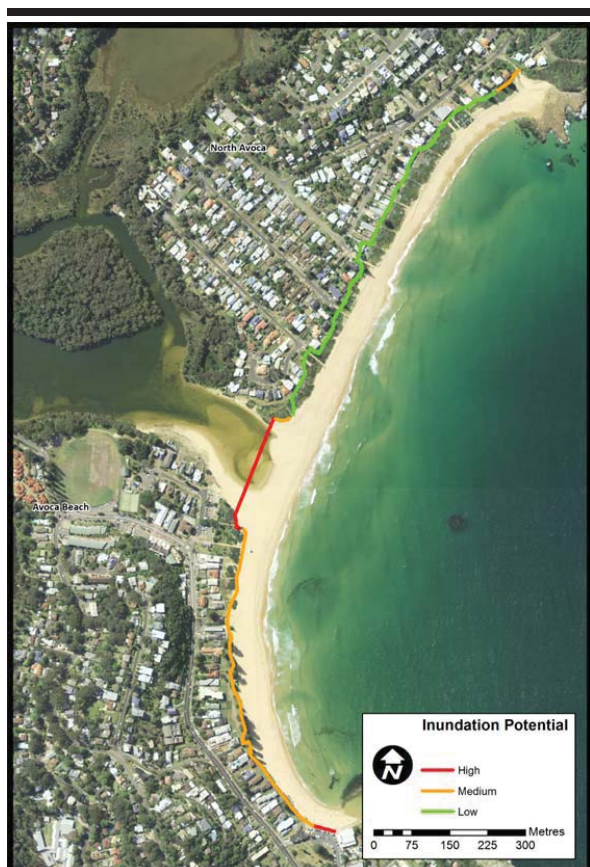
Figure 3. Map showing Avoca site with level of runup inundation potential shown for the 5y ARI case.

Examining the case of the Avoca site and using the 5y ARI values it can be seen (Figure 2) that the South sector dune field is between 3–5 m elevation and E_R is \sim 4.6 m resulting in the sector generally being classified as having Medium runup inundation potential. The exception in this sector is the far southern corner of the beach where runup inundation potential is high. Here a carpark has replaced the dune field. The Central sector includes the entrance to Avoca Lake with very low elevation and thus classified as High potential, however the remainder of the sector consists of a high ( E_D > 6 m) dune field classified as Low potential since E_R in this sector is \sim 4.6 m. Likewise in the North sector the high dune field ( E_D > 6 m) results in a Low potential classification generally despite E_R being larger ( \sim 4.9 m) in this sector, with the exception of a Medium potential area ( E_D < 5 m) in the far north.