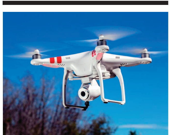
Figure 2. DJI Phantom 2 Vision Quadcopter with integrated camera.

Unmanned helicopters come in many different configurations. One popular, stable design is the quadcopter, a multi-rotor helicopter that is lifted and propelled by four rotors. Quadcopters use two sets of identical fixed-pitch propellers: two rotating clockwise and two counterclockwise. Control of