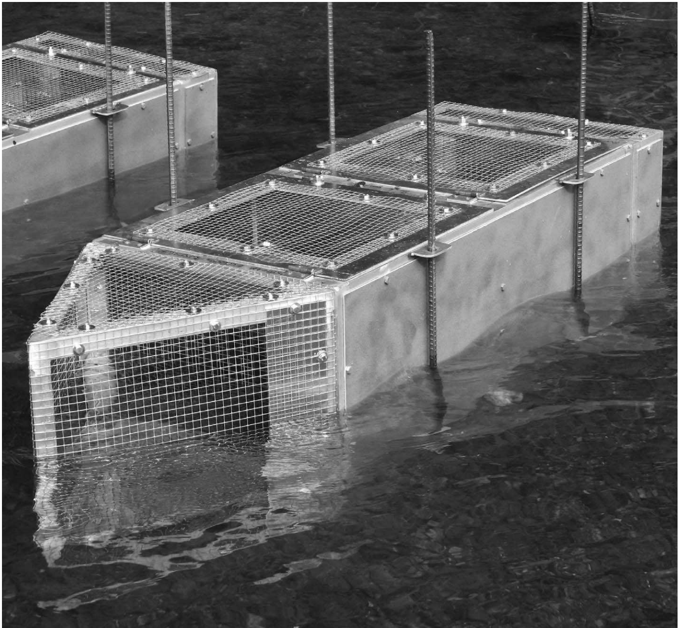
FIG. 3. Flow-through enclosure/exclosures used in field experiments to test for effects of branchiobdellid worms on host crayfish growth (Brown et al. 2012). Flow-through design maintains natural stream conditions while double-walled barriers prevent exchange of branchiobdellidans between enclosed and free-living crayfish (photo credit: BLB).

needed to increase our knowledge of branchiobdellidan diversity and distribution and to inform studies assessing evolutionary and ecological patterns. In addition, work evaluating concordance among different data sets (e.g, morphological, molecular), and thus, species concepts, is needed to infer the evolutionary history of the Branchiobdellida. Basic life-history characteristics and the physiological constraints of most branchiobdellidan species remain undescribed.