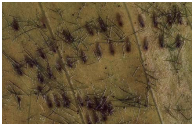
Fig. 5. Extant endophytic “Coenagrionid-type” egg-sets (clutches), zig-zag mode, on a leaf of the water lily Nymphaea . Swollen margins around each egg are visible, as well as red stain concentrations (anthocyanin) caused by the plant–insect interaction. Length of one egg ca. 1.20 mm, photograph: W. HELLMUND.