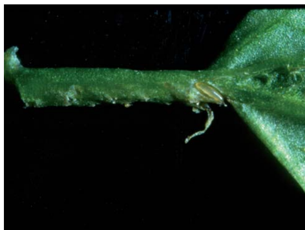
Fig. 2. Extant egg-set of the "Lestid-type" placed in the tissue of a plant stem, in a single discrete row. For one of these eggs, the covering plant tissue has been dissected while the other eggs shine through the covering tissue. Length of one egg ca. 1.40 mm, dissection and photograph: W. HELLMUND.

Coenagrionid damselflies, however, do not seem to prefer a certain plant type in the fossil record (e.g., HELLMUND & HELLMUND 1991, 1996).