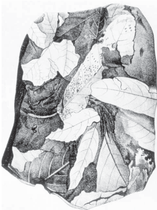
Fig. 6. Fossil angiosperm leaves from the middle Miocene of Salzhausen (Hesse, Germany) preserved within organic substratum, figured as a lithograph in GOEPPERT (1846). The specimen in the centre displays fossil egg-sets of damselflies. GOEPPERT (1846) described and identified them erroneously as epiphytic fungi. The total length of the leaf with egg-sets (centre) is about 8 cm, photograph taken from the lithograph by W. HELLMUND.