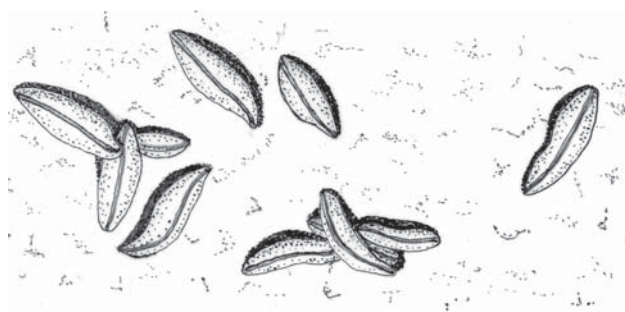
Fig. 7. Sketch of extant epiphytic fungi of Farlowiella carmichaeliana (BERK.) SACC. Length of each fungus is ca. 3 mm. Note the irregular pattern on the plant tissue, clearly differing in size and morphology from zygopteran egg-sets. The fruiting bodies of the fungi display a more or less sunken slit. Sketch by W. HELLMUND, modified from BENEDIX et al. (1974).

At first, the mother insect actively modifies a plant substrate when carving out a depression. It thus clearly creates a trace fossil according to the definition of BERTLING et al. (2006, p. 266). In creating these pits, the damselfly follows a specific recurrent behaviour of moving side-ward, back and forward, thus creating a special pattern of