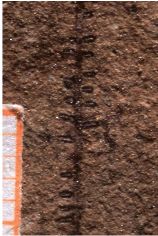
Fig. 4. Enlarged detail of Fig. 3, showing the dark swollen margins of the plant tissue surrounding each egg. Length of one egg = 1.20 mm – 1.40 mm (from HELLMUND & HELLMUND 2013).