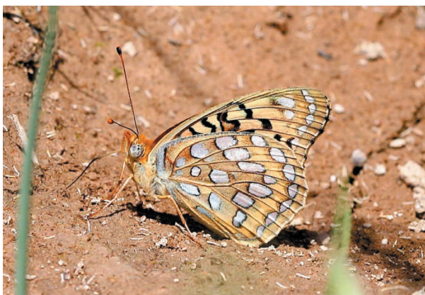
FIG. 6. Male Argynnis coronis imbibing from damp mud in June.

shrubs showed a 'startle response' when disturbed, rapidly opening and shutting wings with no flight. Two copulating pairs were seen with females carrying males (Fig. 5). Nectaring occurred primarily on two buckwheat species, Eriogonum heracleoides Nutt. (Parsley Buckwheat) and Eriogonum compositum Dougl. ex Benth (Northern Buckwheat). Males were also seen during June imbibing from damp mud in groups of up to a dozen (Fig. 6). Eclosion was still occurring at this site on 17 June with fresh females clinging to low shrubs and conspicuous mate-searching by males. Four hours of observation on 1 July resulted in ~40 males seen searching for females which appeared to be absent. Most individuals showed significant wing wear on this date. By mid June all Viola host plants have withered and desiccated, remaining dormant until the following March.