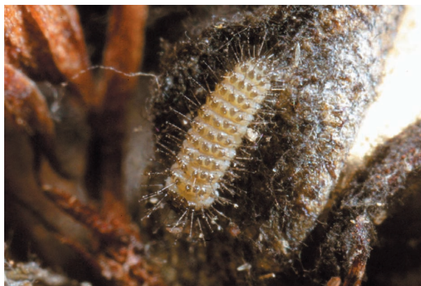
FIG. 1. Overwintering unfed first instar larva of Argynnis coronis .

(Sagebrush Violet), occurs (Fig. 4). It is possible that some individuals overwinter at slightly higher elevations associated with other violet species (e.g. V. nuttalli Pursh.). Overwintering larvae diapause and do not readily respond to normally favorable stimuli (e.g. warmth and host plants), for ~ 3 months after hatching (James 2008). In the laboratory, larvae exposed to cold conditions (5 °C) and darkness for 80 days broke diapause and commenced development reaching adulthood after 54 days at 25 °C (James 2008). Larvae of Argynnis spp. are notoriously difficult to find, especially early instars, thus it is unclear when larvae of A. coronis begin feeding. Third instar larvae were discovered under rocks in the vicinity of V. trinervata (Schnebly Coulee, north ridge, Kittitas County (46.95 ° N, 120.09 °