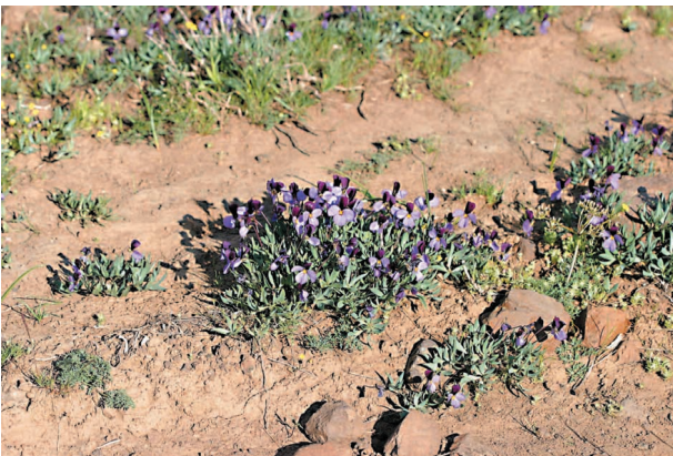
FIG. 4. Larval host of Argynnis coronis , Sagebrush Violet ( Viola trinervata ), in spring.