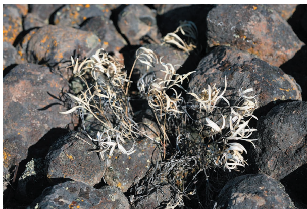
FIG. 7. Desiccated Sagebrush Violet ( Viola trinervata ) at Cowiche Mountain in October.

Once mated, females appear to undertake an upslope, westerly migration, which ultimately takes them to the highest peaks of the Cascade Mountains (Fig. 3). On 4 June 2009, an estimated 150 A. coronis females were seen flying rapidly westward in a number of meadows and along roads and trails near Rimrock Lake, 53 km west of Yakima, Yakima County (46.62° N, 121.18° W, 1134 m) during 4 hours (10:00–14:00h, sunshine, 25–27 °C). During 13:00–14:00h, females passed through a meadow at a rate of 2–3 per minute. Flight was purposeful and mostly uninterrupted by nectaring. Limited nectaring was observed mid morning on dandelion and Ceanothus . Captured females (35) had plump abdomens and all continued westward flight after release. No males were seen. On 17 June 2010, 32 females were seen flying westward at Cowiche Mt in partial sunshine and temperatures of 18–21 °C during two hours.