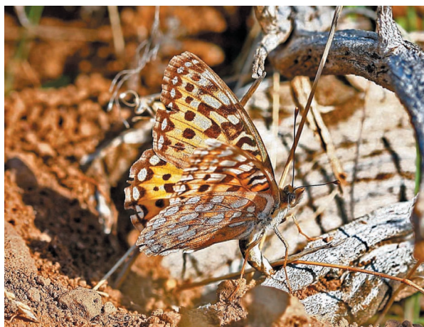
FIG. 8. Female Argynnis coronis ovipositing on wood of Artemisia rigida on the ground at Cowiche Mountain on 12 October 2010.

Adults: Non-reproductive females overwintering at high elevations. Argynnis coronis adults are generally absent in shrub-steppe localities from about the end of June until September. No A. coronis adults were observed from 8 July–30 August 2005–2010 on multiple field excursions at Cowiche Mt, Bear Canyon, Umtanum Canyon and many other shrub-steppe locations near Yakima, Ellensburg and Wenatchee. In 2010 the last individuals (worn males) were seen at Cowiche Mt on 7 July. The majority of males appear to remain in sage-steppe until death, although a small number apparently follow females upslope. Males and females were present at Satus Pass, Klickitat County (45.92° N, 120.65° W, 987 m) on 13 June 2007, likely en route to higher elevations, but this location is only ~5 km from the nearest shrub-steppe habitat (500–600 m). Female-dominated populations of A. coronis occur at high elevations (2000–2500 m) in the Cascade Mountains during July–August, for example at Bear