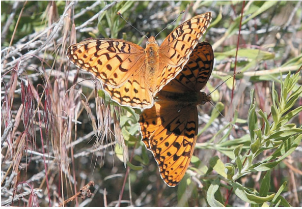
FIG. 5. Copulating pair of Argynnis coronis in June.