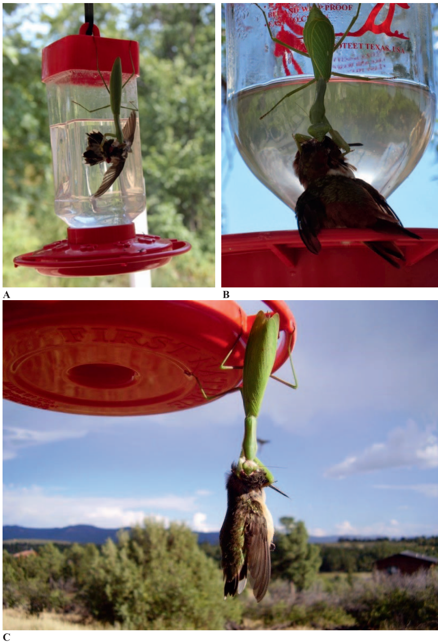
FIG. 1. Predation of birds by mantids at hummingbird feeder locations in the USA. (A) Tenodera sinensis eating a Ruby-throated Hummingbird ( Archilochus colubris) in Green Castle, Missouri ; (B) Stagmomantis limbata eating Allen's Hummingbird ( Selasphorus sasin) in San Juan Capistrano, California ; and (C) Mantis religiosa eating a Black-chinned Hummingbird ( Archilochus alexandri) in Millwood, Colorado.

The preponderance of predation events of hummingbirds in North America can be explained by several factors. First, North America is inhabited by some of the world's smallest birds,