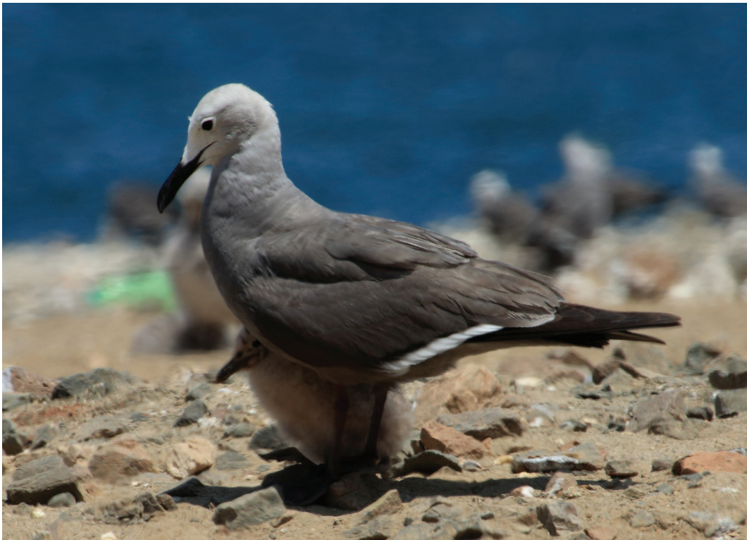
Figure 2. Adult Gray Gull shading a chick at the coastal colony of Playa Brava, northern Chile.

The Playa Grande colony was inspected on 6 January 2015 and included 40 nests: 93% contained only eggs, 3% contained