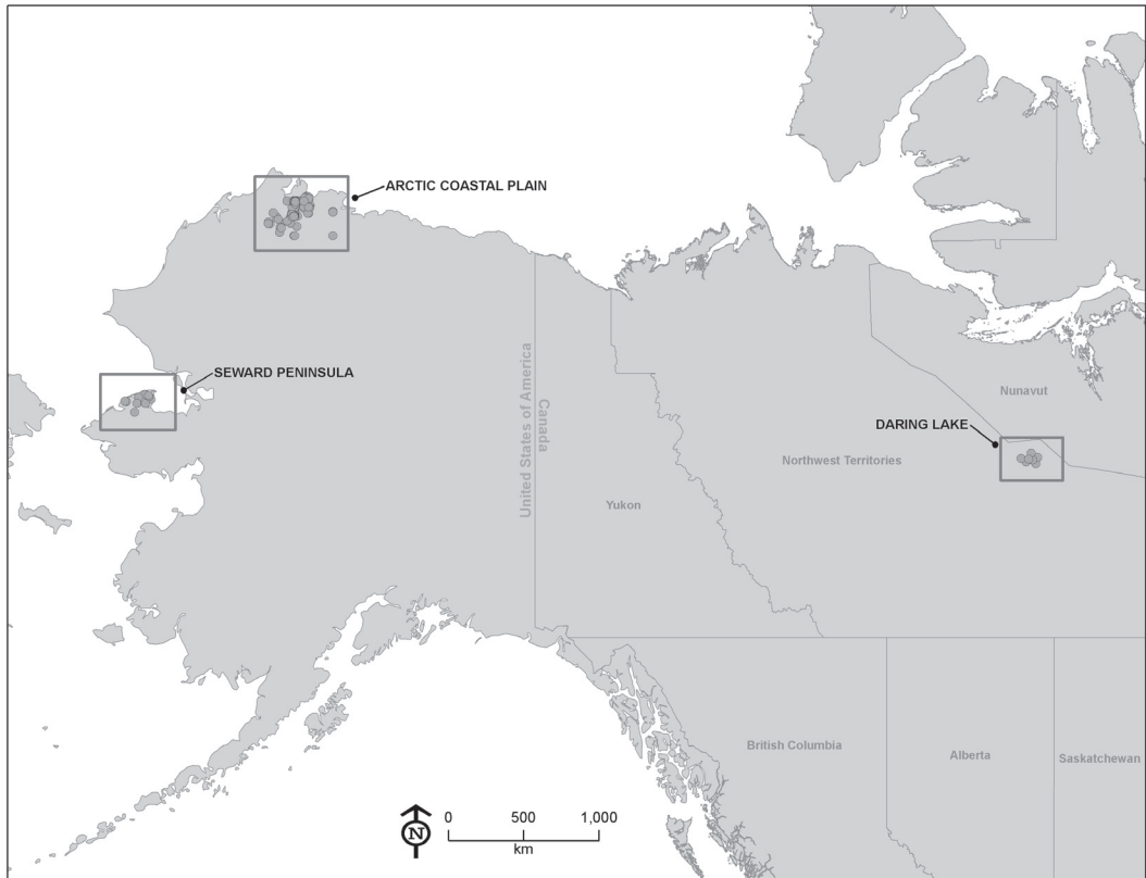
Figure 1. Study sites for sample collection in Yellow-billed Loons, 2002 to 2012.

(Earnst et al. (2005). The landscape is composed of a continuous permafrost environment, with a shallow active layer under tundra plant communities (< 1 m) and somewhat deeper active layers (taliks) underneath lakes. Unlike boreal forest areas, such as those within interior Alaska, where discontinuities in permafrost allow deep subsurface flow and connectivity, the shallow active layers of the ACP and the impermeability of the permafrost trap labile water near or at the surface. Thus, despite the ACP receiving relatively minimal annual precipitation (15-25 cm/year), it is replete with many small and large lakes (> 100,000), as well as highly saturated soils in many plant communities (Walker et al. 2005).