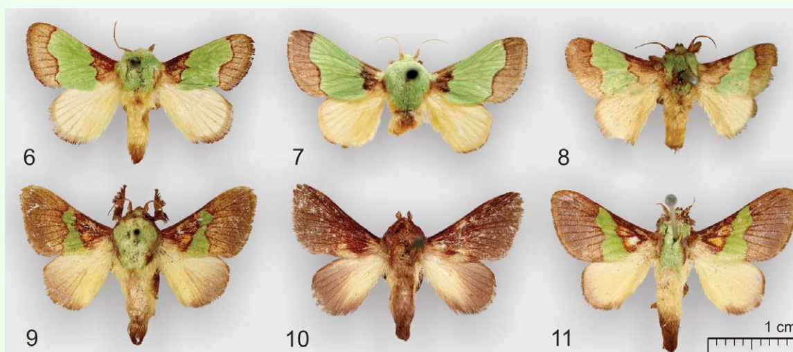
Plate 2. Figures 6–11. External view of the related species; 6 – Parasa ananii Karsch, 1896, holotype, ZMHB; 7 – P. thamia Rungs, 1951, holotype, MNHN; 8 – P. catori Bethune-Baker, 1911, holotype, BMNH; 9 – P. divisa West, 1940, holotype, BMNH; 10 – Delorhachis amator Hering, 1928, holotype, ZMHB; 11 – Stroter comatus Karsch, 1899, holotype, ZMHB. High quality figures are available online.