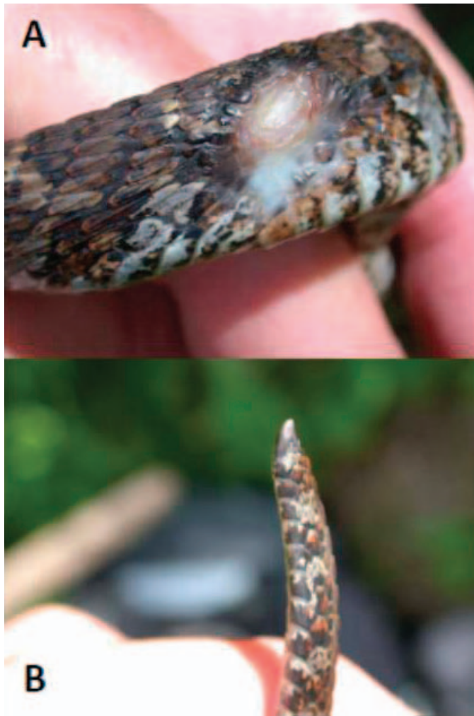
FIG. 1. Examples of injuries in Common Watersnakes ( Nerodia sipedon ). (A) Injury to body. (B) Loss of end of tail.

venomous snakes. True, some natricines are mildly venomous, and people sometimes react to their bites (Hayes and Hayes, 1985; Gomez et al., 1994), but I am not aware of any fatalities or long-term effects from such bites. In fact, Rhabdophis is the only natricine genus that has any dangerously venomous species (Greene, 1988, 1997), but when molested, these snakes generally resort to other antipredator measures before biting (Mori and Burghardt, 2001).