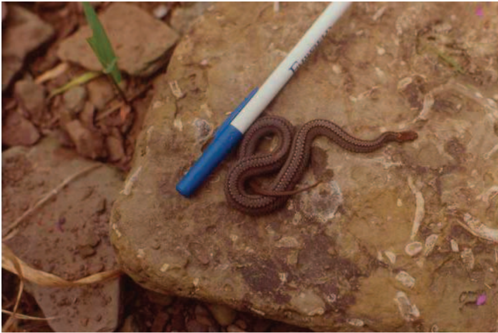
FIG. 3. An adult female Storeria occipitomaculata . Although individuals of this small species are sometimes found in the open, they are typically found hiding under cover such as rocks.

it. I am usually alerted to this if somebody else notices the snake or if the snake decides to move away soon after I've nearly stepped on it, but if the snake does not move, I easily might not see it at all and simply move on. In any case, the snake faces a dilemma—whether to move or to remain frozen in place. Either action could be the correct one, but either also could be an error. A decision has to be made especially quickly if the predator surprises the snake (and perhaps itself) by coming upon the snake suddenly and at close quarters, an experience I have had as a snake hunter many times.