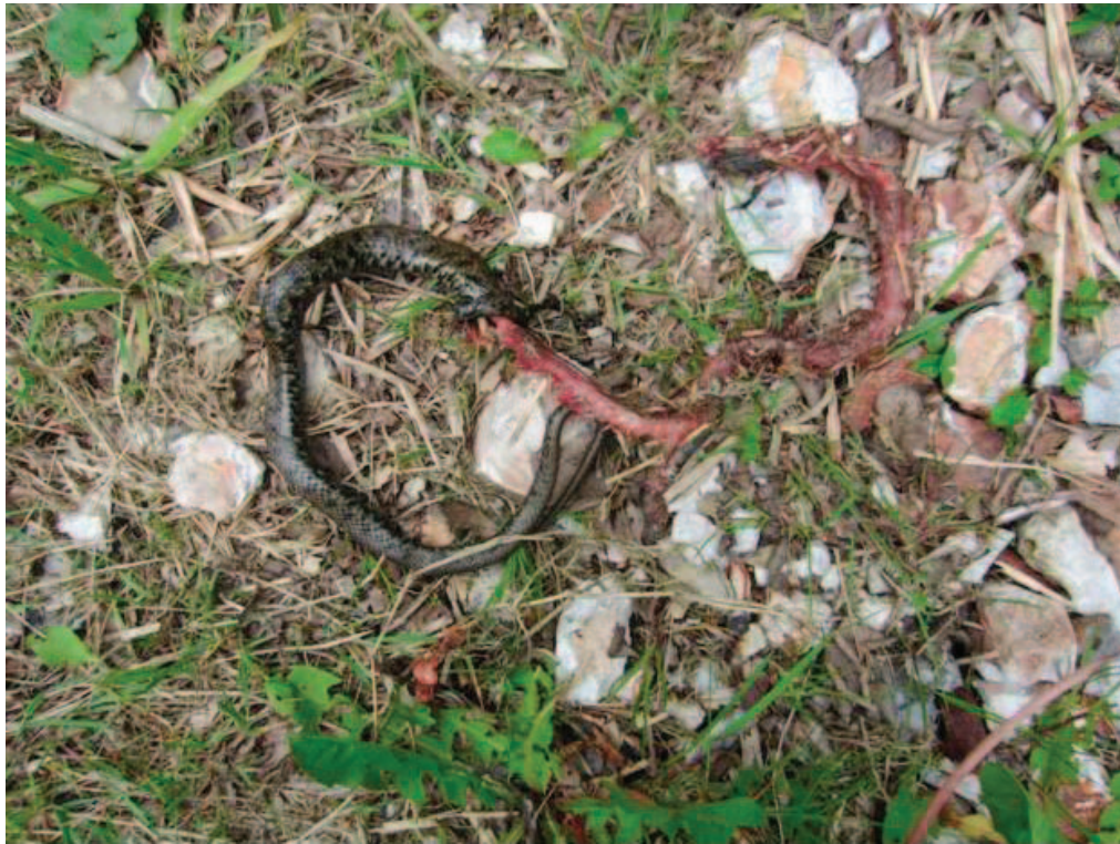
FIG. 2. A recently killed Natrix natrix found in the field.

Approach and attack may be combined as one single action but can also be separate, as in the case of a predator approaching a prey but failing to attack because of aggressive defense posturing by the prey (Arnold and Bennett, 1984; Greene, 1997) or because of “flash” or “startle” coloration that is exhibited when the prey’s body is flattened defensively (Shine et al., 2000; Westphal, 2007). This sequence can be simplified even further as a continuum from avoiding detection through avoiding capture to avoiding consumption.