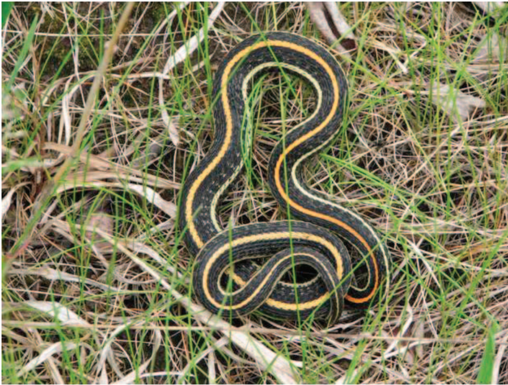
FIG. 5. Head-hiding behavior in a Thamnophis radix .

this behavior (Gregory, 2008a; Fig. 6). Among other natricines, at least four species of Thamnophis (Gregory and Gregory, 2006; Schield and Wayne, 2012; Enge, 2015), two species of Storeria (Jordan, 1970; Gerald, 2008), and one species of Regina (Oldham et al., 2015) may exhibit elements of death-feigning behavior when handled.