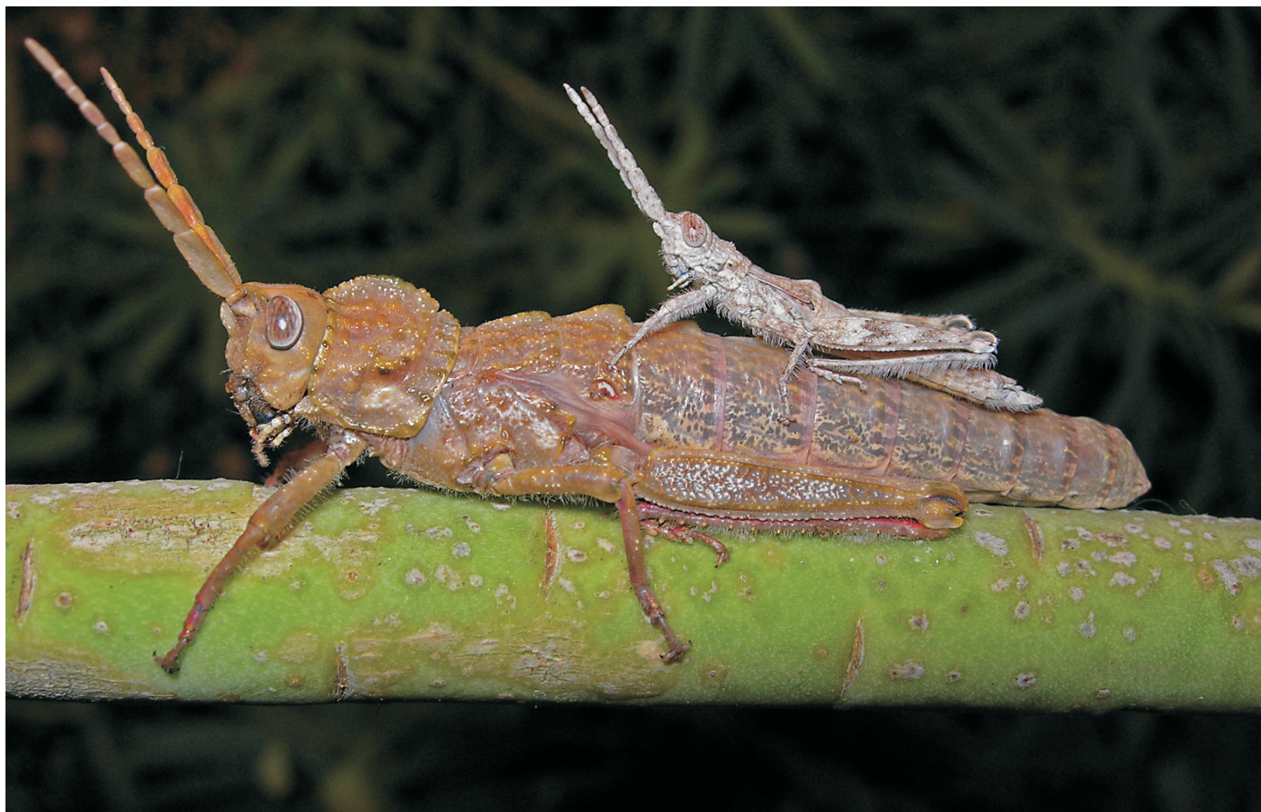
Fig. 2. Adult male and female Purpuraria erna Enderlein (Pamphagidae) from Fuerteventura Islands, Canary Islands, Spain, showing extreme sexual size dimorphism. See back cover.

in part, from the different roles of males and females in reproduction ( i.e. , expensive eggs vs inexpensive sperm) (Fairbairn 1997, Blanckenhorn 2000, Fairbairn et al. 2007, Fedorka et al. 2007, Cueva del Castillo & Núñez-Farfán 2008, Hochkirch & Gröning 2008, McCartney & Heller 2008): 1) Fecundity selection on females should select for large female size, because female reproductive fitness is strongly correlated with female body size (see above, Honek 1993). 2) Sexual selection via male-male interactions, female choice, or the need to overpower resistant females (Andersson 1994, Cueva del Castillo & Núñez-Farfán 2008) may produce SSD. 3) Natural selection, including intersexual competitive exclusion or different ecological niches for males vs females, may produce SSD. These selective forces interact in complex ways to produce different types of SSD. Note that individuals that choose a large mate often enjoy higher fitness (Gwynne et al. 1984, Brown 1999), thus favoring both the evolution of large size and size discrimination in mating.