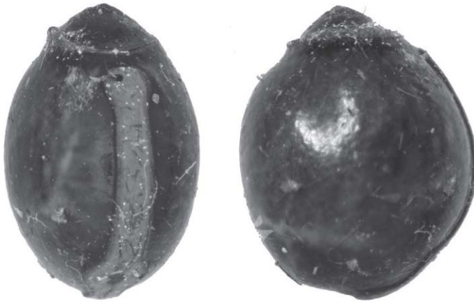
Fig. 2. The single, unbroken E. tiaratum egg collected from the manure of a chicken.

or shell halves of the R. artemis eggs and three whole but crushed, R. nematodes eggs were recovered from the quail manure (Fig 3). All other eggs had been digested beyond recognition. In total, out of 935 eggs fed to the birds, 884 were eaten (94.5%), and of these, only one (0.11%) passed the gut whole enough to remain viable.