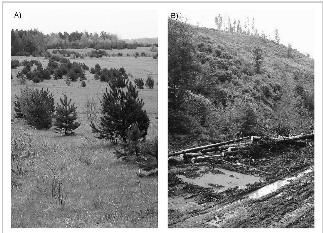
FIGURE 2 (A) Large-scale clear-cutting in Rakchiv district, Ukraine; (B) forest expansion on former farmland in the Polish Bieszczady Mountains.