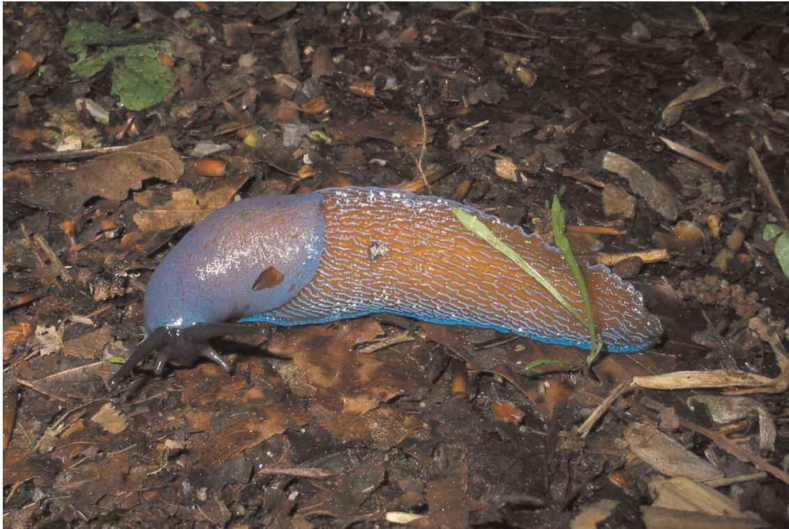
FIGURE 3 The endemic Carpathian blue slug, Bielzia coerulans .

Carpathians (Kozak et al 2007a); for such studies, access to historic Austro-Hungarian maps is crucial.