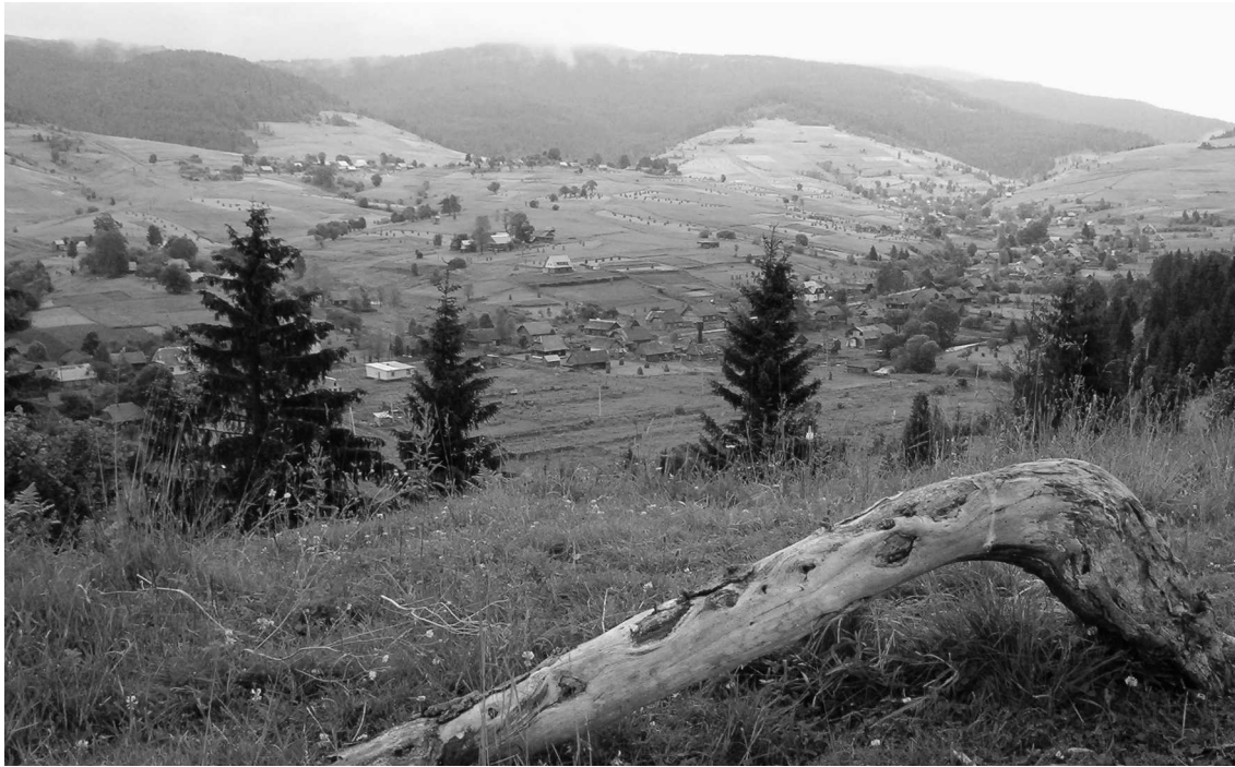
FIGURE 4 The village of Volosyanka in Ukraine, 2007: ecosystem services in the Carpathians are a basis for traditional cultural landscapes.