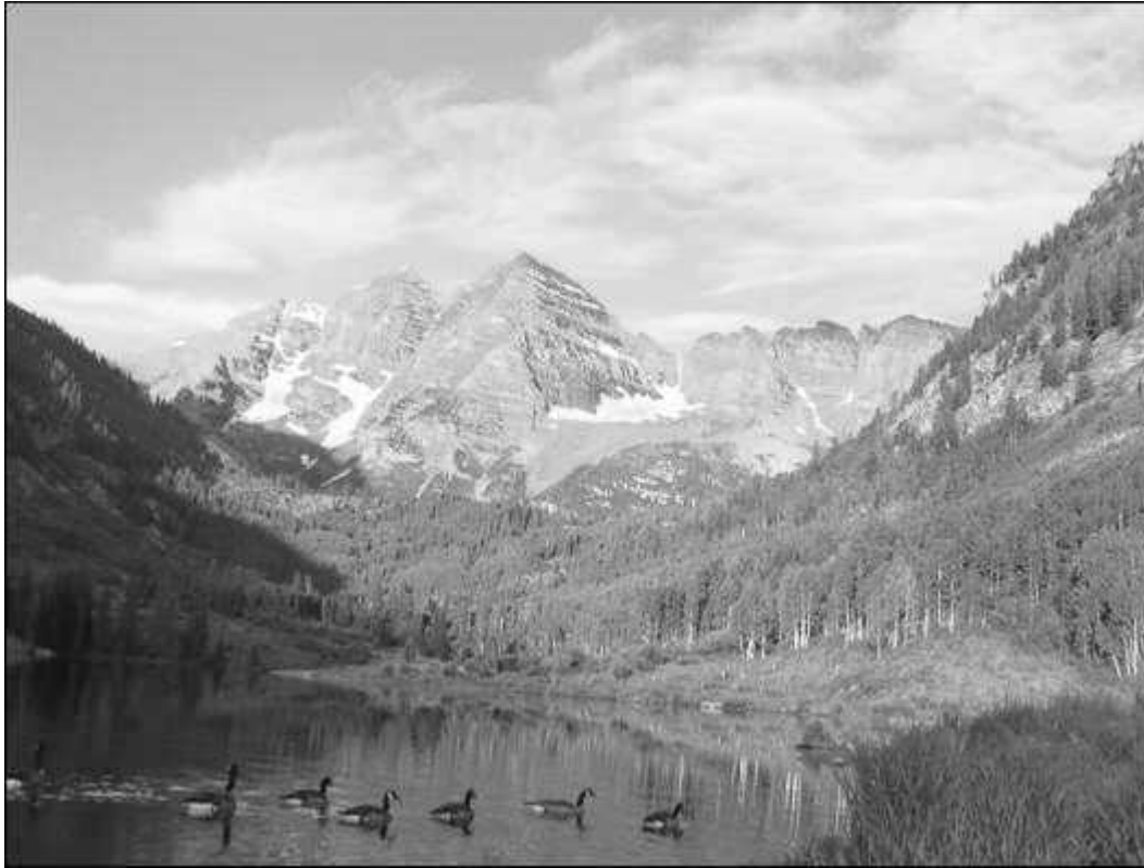
FIGURE 1 The Maroon Bells in the Elk Range near Aspen, CO, are a signature for the pristine alpine beauty of Colorado's Fourteeners. (Photo by Jon Kedrowski, August 2006)

study was performed by members of the Rocky Mountain Field Institute (RMFI) in the Sangre de Cristo Range of southern Colorado addressing the restoration efforts on Humboldt Peak (Hesse 2000). The information presented in the case of Humboldt Peak provided a good overall physical description of what is occurring on all of the Fourteeners. However, the study failed to directly address values indicating climber-visits to Humboldt Peak.