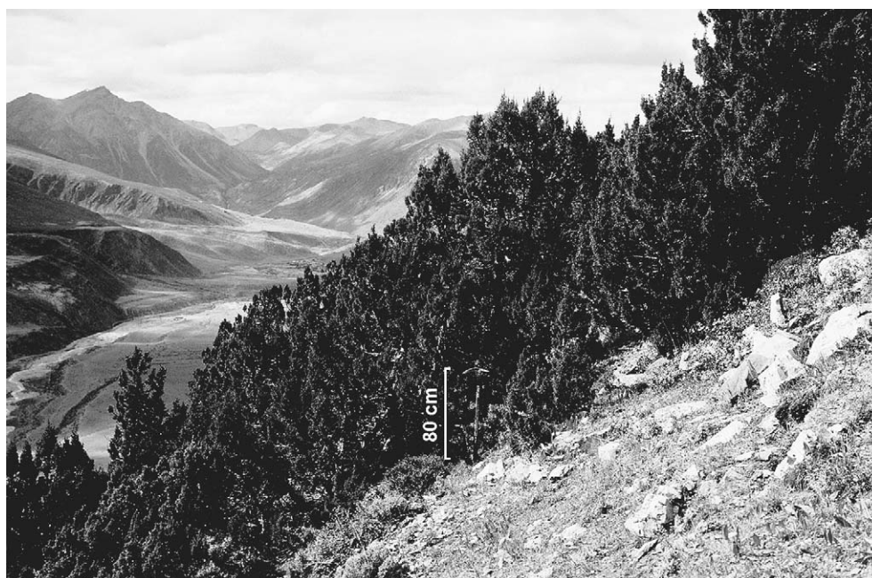
FIGURE 2 Highest forest stand of Juniperus tibetica in southeastern Tibet, located at 4900 m (29°42' N / 96°45' E Gr). (Photo by Georg Miehe, 17 September 2004)

Asia (Miehe and Miehe 2000) confirm widely accepted evidence that the upper limit of the forest belt is not a line but an ecotone (Körner 1999). The 'highest tree-line' therefore designates an imaginary line connecting scapose phanerophytes. In most humid mountain ranges, single or multi-stemmed woody perennials become increasingly less abundant, forming a pattern that shifts from a closed crown-interlocking forest to isolated individuals. Simultaneously, their heights gradually decrease until they barely emerge from a closed layer of shrubs (Miehe and Miehe 2000).