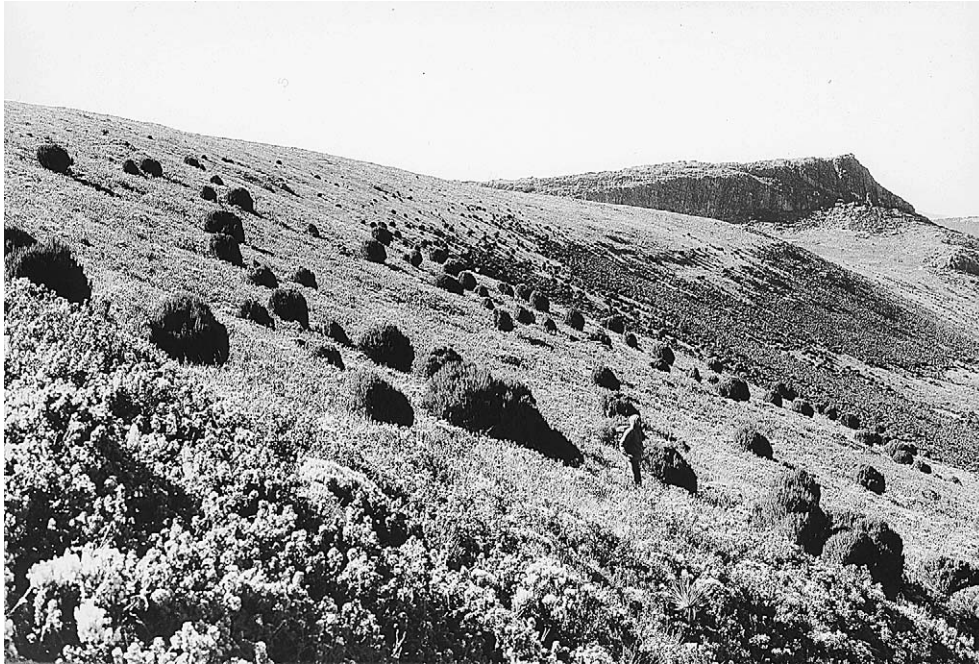
FIGURE 3 Probably undisturbed treeline ecotone in southern Ethiopia: Erica thicket disintegrates into isolated spherical individuals. The soil is completely shaded with a thicket of 30 to 50 low scrambling Alchemilla haumannii . Bale Mountains, Wasama, 6°55' N / 39°46' E, 4080 m. (Photo by Georg Miehe, 11 January 1990)

(21 August, 16–19 September 2004) suggest that this valley is a wind channel for strong and dry southerly winds. Since the radiative forcing at the site is certainly very different from that recorded at the nearest climate stations, it is doubtful whether any conclusions about the climatic conditions at the local treeline can be drawn, as the climatic causes of treelines are still under-investigated (Körner and Paulsen 2004).