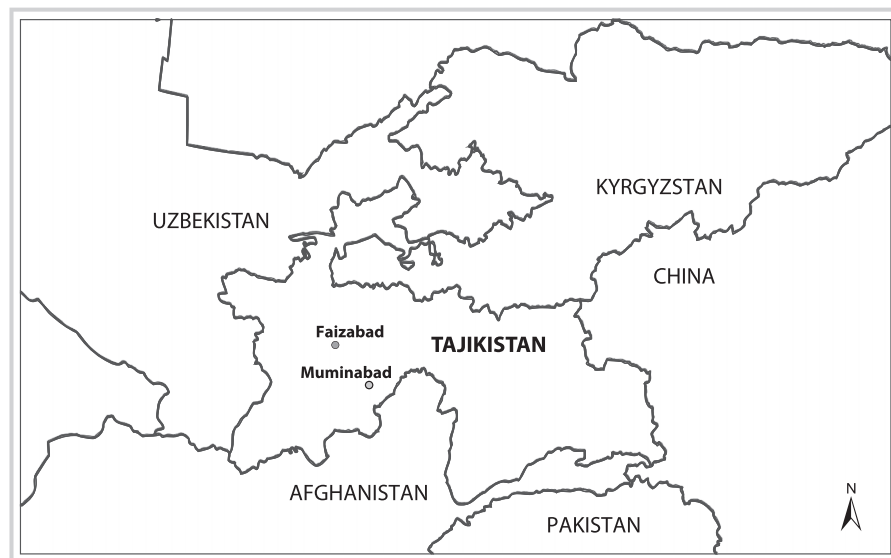
FIGURE 2 Location of the 2 study areas. (Map by Bettina Wolfgramm)

was defined using the area of land managed and number of animals kept—common criteria in similar studies (Shepherd and Soule 1998; Pfister 2003; Shigaeva et al 2007). We divided the smallholders participating in the study into 3 categories: small, medium, and large. For each smallholder category, parameters were derived from the interview data. Stocks and flows of biomass were calculated on the basis of these parameters.