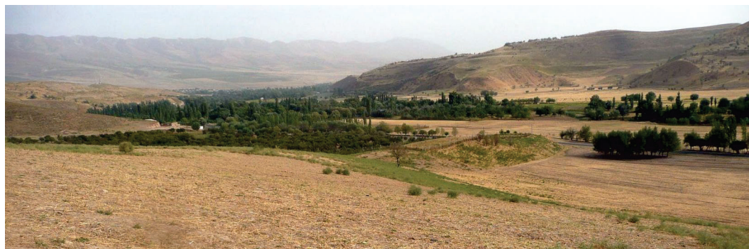
FIGURE 3 A Muminabad landscape typical of the study region with food plains and moderate-to-steep slopes.

In a first step, informal talks with farmers and field observations were carried out to gain the information needed to develop the interview questionnaire; this can be found in the Supplemental Material , Appendix S1 ( http://dx.doi.org/10.1659/MRD-JOURNAL-D-14-00114.S1 ). For use in new regions, the questionnaire needs to be adapted on the basis of the relevant literature, field observations, and informal talks. In a second step, questionnaire-based interviews were conducted with 21 smallholders, 10 in Muminabad and 11 in Faizabad. The study also drew on a complementary data set on household energy consumption, based on interviews commissioned for this study and carried out in 35 households from 2 villages in the Faizabad study area in February 2011.