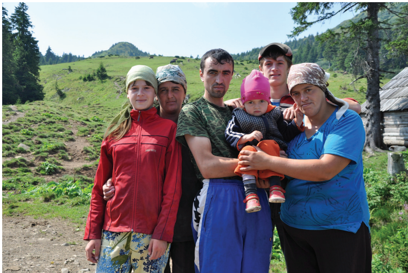
FIGURE 2 Hutsul family that used to work each summer on a cattle farm below Mt Petros in the western Chornohora, just outside the CBR.

land ownership. These differences, in our opinion, have been recently reinforced by a shift in land management policy: 1-year leases for mountain pastures are being replaced by 49-year leases. This has already been implemented in the Ivano-Frankivsk region. Adding a further degree of complexity to land management patterns in the region, some of the farms operate within 1 of 2 large protected areas: the Carpathian National Nature Park (CNP) and the Carpathian Biosphere Reserve (CBR).