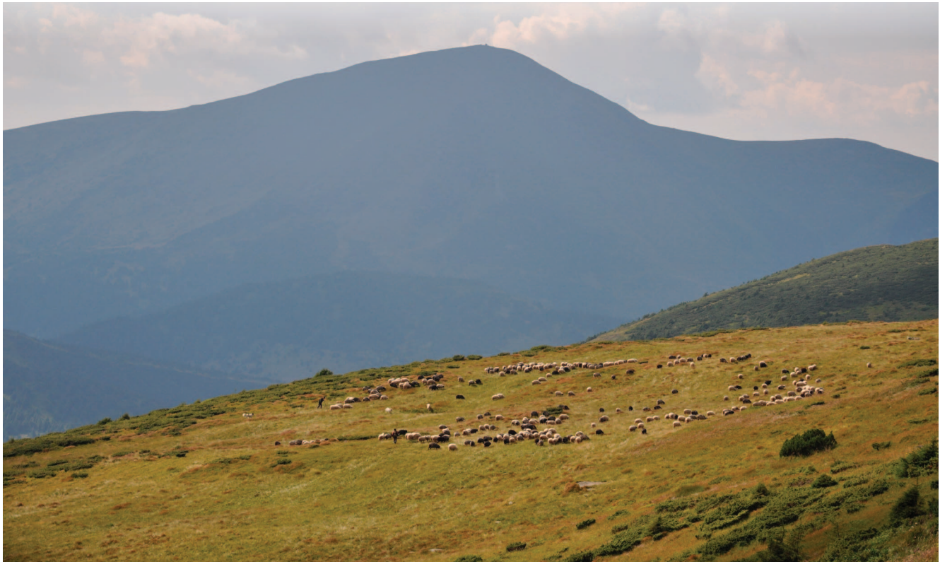
FIGURE 4 Sheep grazing on a subalpine polonyna in the western Chornohora in the CBR buffer zone.