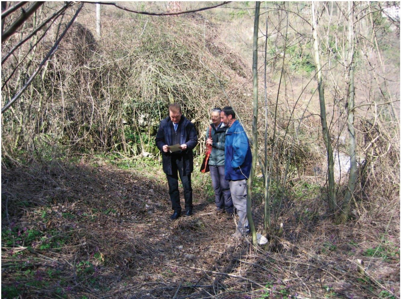
FIGURE 3 Transfer of the first abandoned land in Valstagna, near Case Giaconi, covered by bushes, to 2 retired teachers from the city of Bassano del Grappa in 2009.