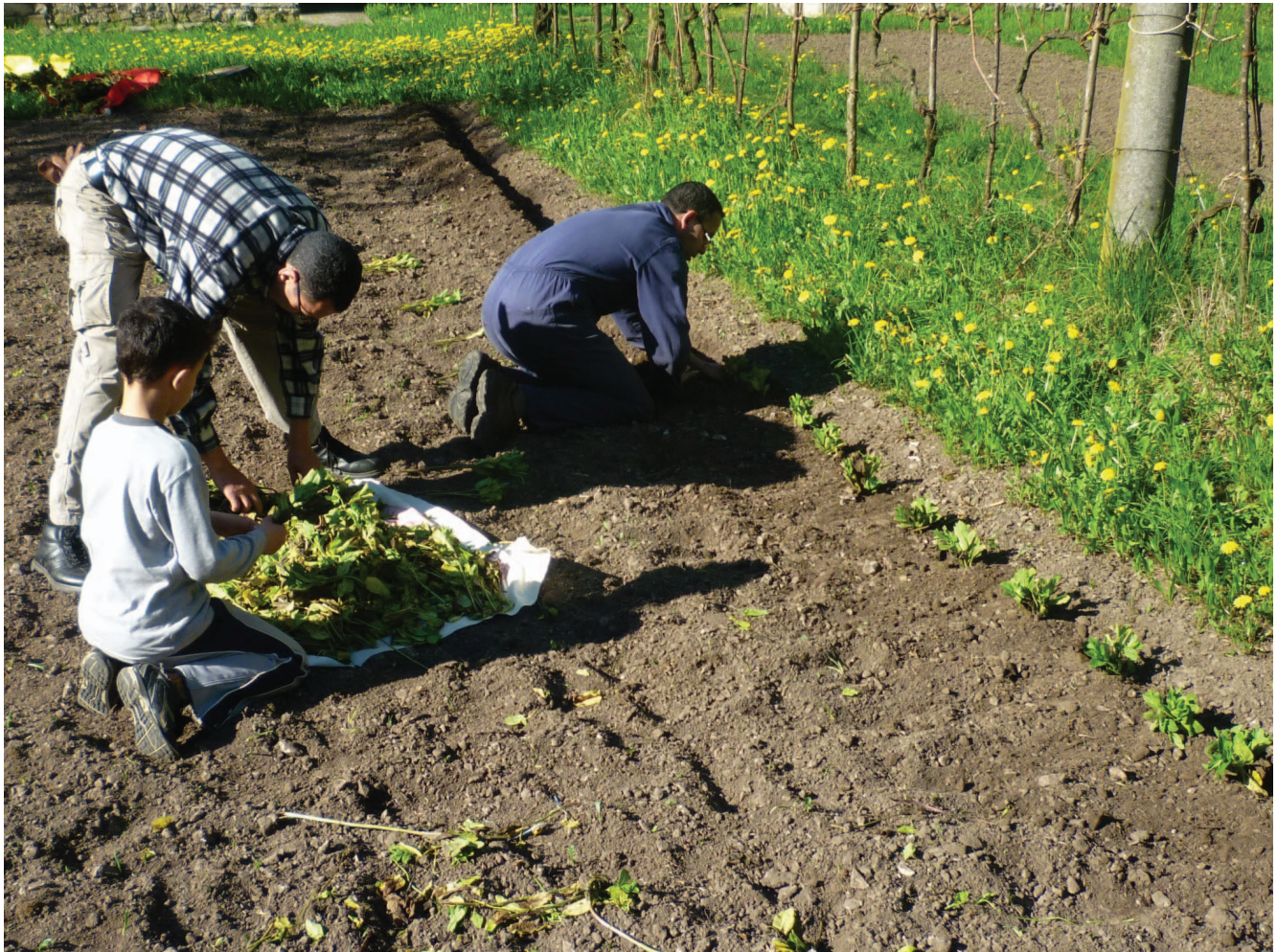
FIGURE 5 Planting mint in 2011 in a terrace in Valstagna near Ponte Subiolo adopted by a family of Moroccan immigrants.

The committee, in addition to coordinating land assignments, provides technical and agricultural-extension support. It also organizes cooperative efforts to support the most demanding activities, thus having constant contact with participants and monitoring any problems that emerge from the adoptions.