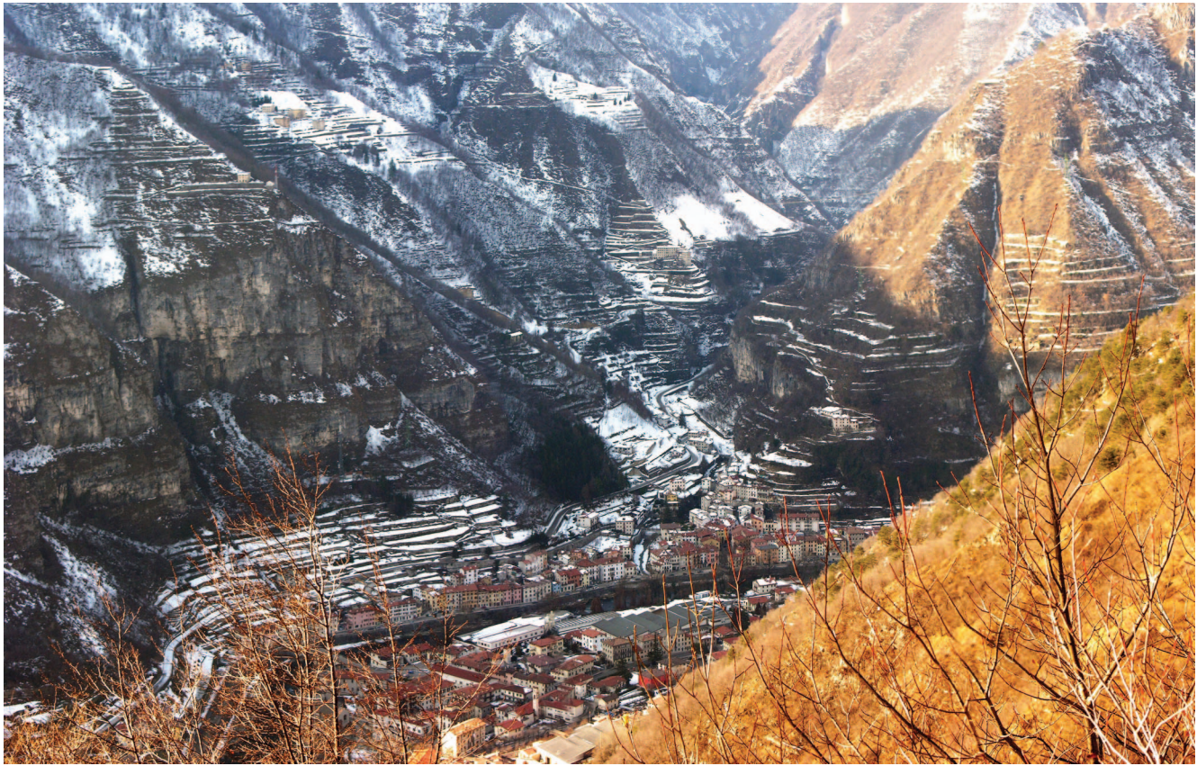
FIGURE 1 The terraced landscape of Valstagna in 2006, with a recent snowfall highlighting the abandoned lands over Lora and Londa.

production agriculture, environmental protection, and cultural preservation, was developed with the goal of making abandoned lands available for sustainable reuse. The key question was how to transfer the historical and environmental value recognized by outsiders into specific recovery practices inside the valley.