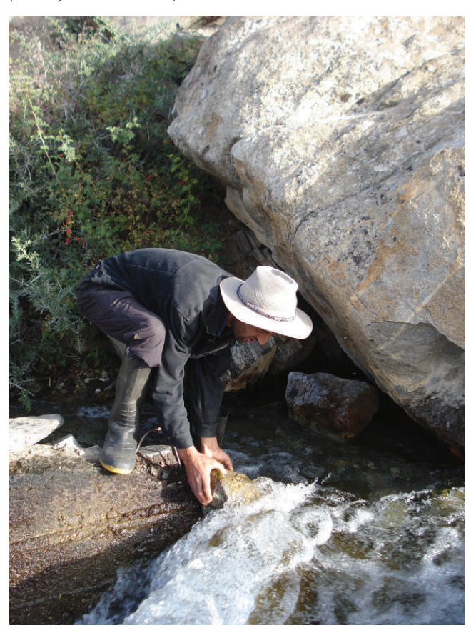
FIGURE 1 The mirju (water master) removes stones from the canal in Spienz.

Finally, the linkages between formal water institutions and gendered agency are mediated by locally and historically specific and dynamic configurations of claims, responsibilities, and rights. As earlier gender and irrigation studies also showed, these are articulated in households through what Jackson has called the conjugal contract (Jackson 2009). Our analysis shows that they also involve wider networks of interdependencies and mutual help. Hence, agential powers—for instance, for accessing or controlling water—reside in one's capacity to maintain interpersonal networks both within and beyond households. Our findings further suggest the importance of including men's and women's own perception of their powers or the value of their work in the analysis of gendered agency. This depends on their aspirations and sense of gendered selves, which in turn are colored both by prior cultural experiences and by imaginings of possible futures.