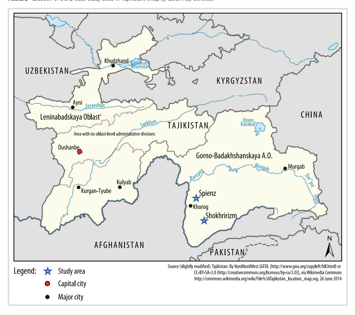
FIGURE 2 Location of the 2 case study sites in Tajikistan. (Map by Sarah-Kay Schotte)

considered the number of female-headed households and emigrants. Consequently, 2 villages were selected: Spienz (with 49 households and 276 inhabitants), situated in the Gunt valley at 2345 masl, with a latitude and longitude of 37°31′31″N and 71°37′17″E, approximately 20 kilometers from Khorogh, the capital of Gorno-Badakhshan, and Shokhririzm (with 56 households and 339 inhabitants), situated in the Shokhdara valley at 2983 masl, with a latitude and longitude of 37°11′49″N and 71°59′14″E, approximately 80 kilometers from Khorogh (Figure 2).