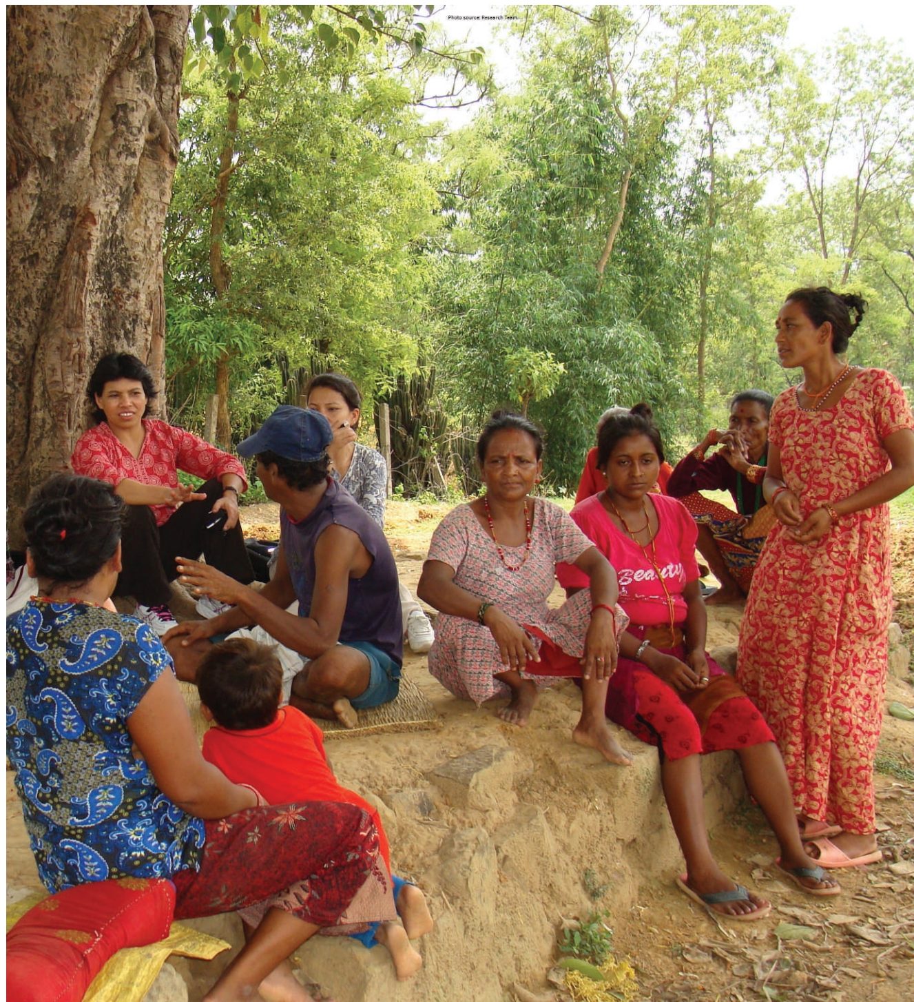
FIGURE 3 Dalit man explaining how Dalits in his community are participating in the REDD+ process.

provided more input during meetings. The gender-unequal structure of the committees and their technical agendas often discouraged women from raising their concerns openly and participating effectively in meetings (see also Nightingale 2002, 2006). A woman member of the