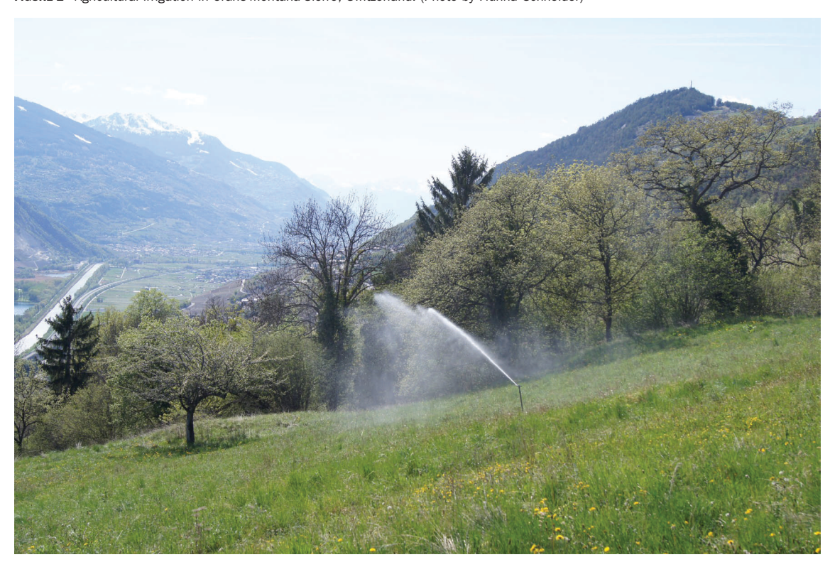
FIGURE 1 Agricultural irrigation in Crans-Montana-Sierre, Switzerland, (Photo by Flurina Schneider)

long term" (Wiek and Larson 2012: 3156). Current research, however, tends to focus on isolated components such as the physical system, the socioeconomic system, or technical issues (Wiek and Larson 2012). Key points for more holistic, sustainable water governance have emerged (Hedelin 2007; Pahl-Wostl et al 2010; Wiek and Larson 2012), but ways to put them into practice still seem somewhat elusive.