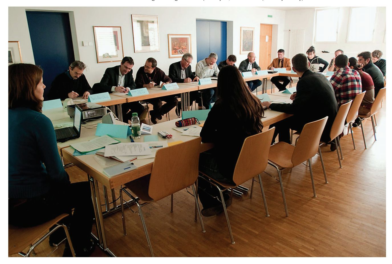
FIGURE 2 Stakeholders discuss sustainable water use strategies during a workshop in Veyraz, Switzerland.

transdisciplinary research in general and to the sustainable management of natural resources.